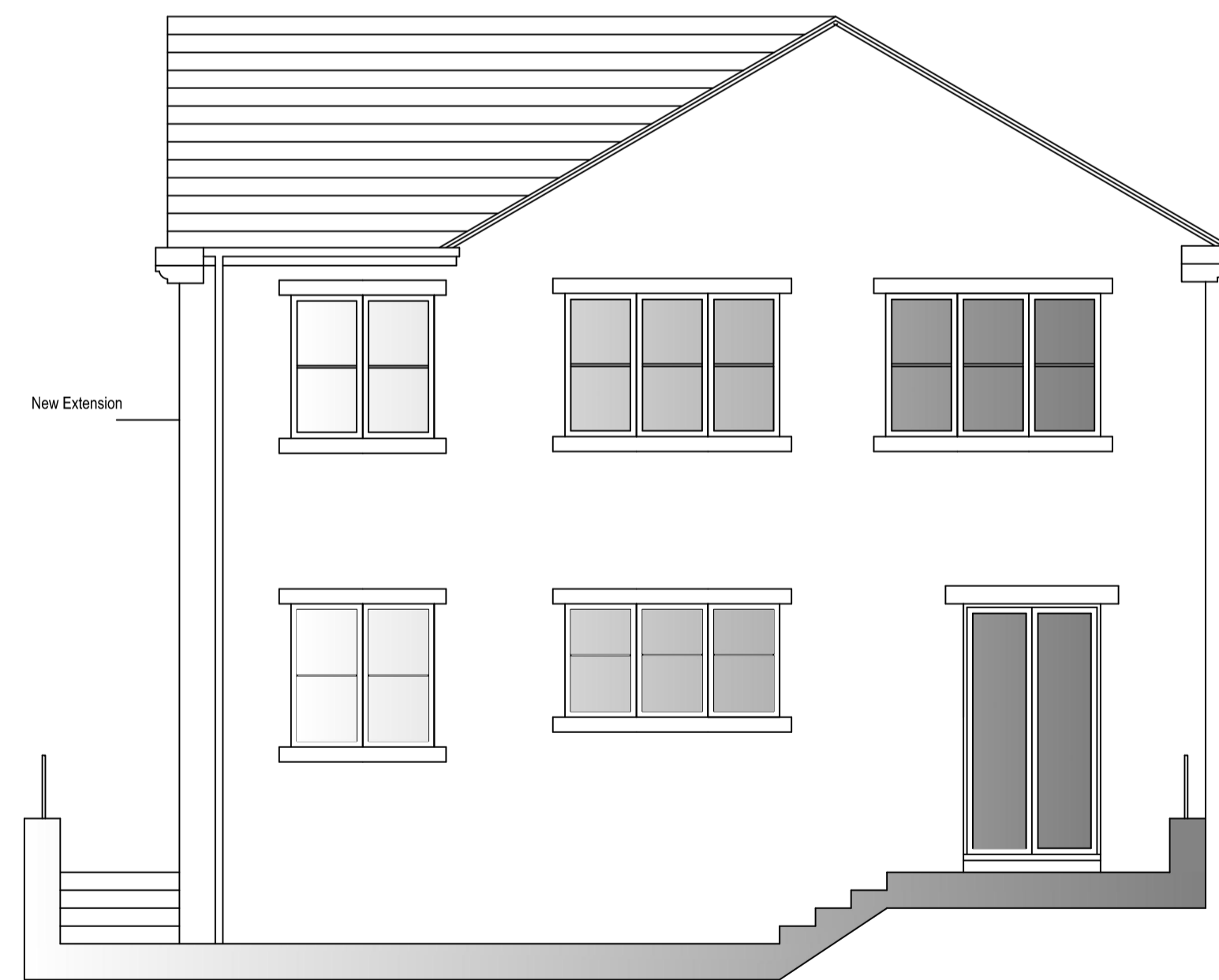
PROPOSD REAR ELEVATION