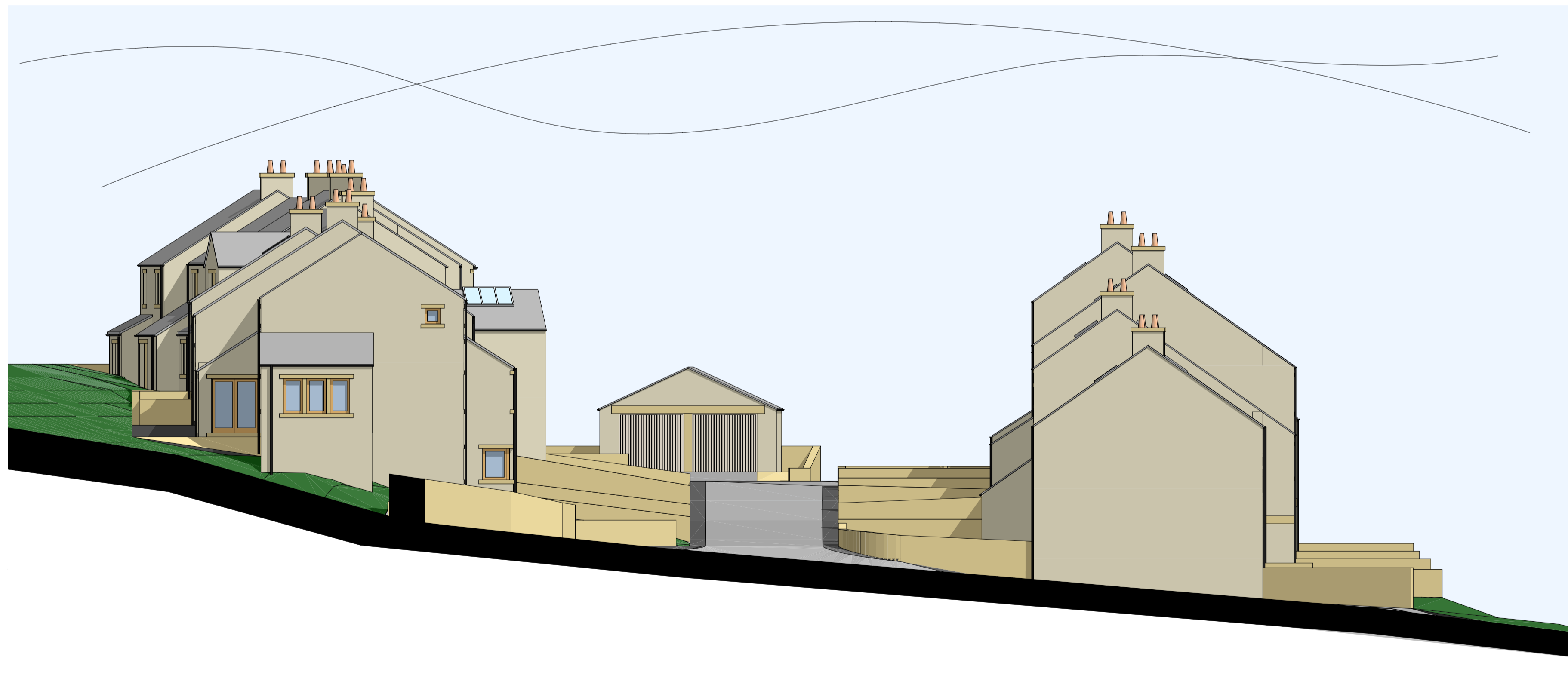
Block A-C West Elevation 1:125