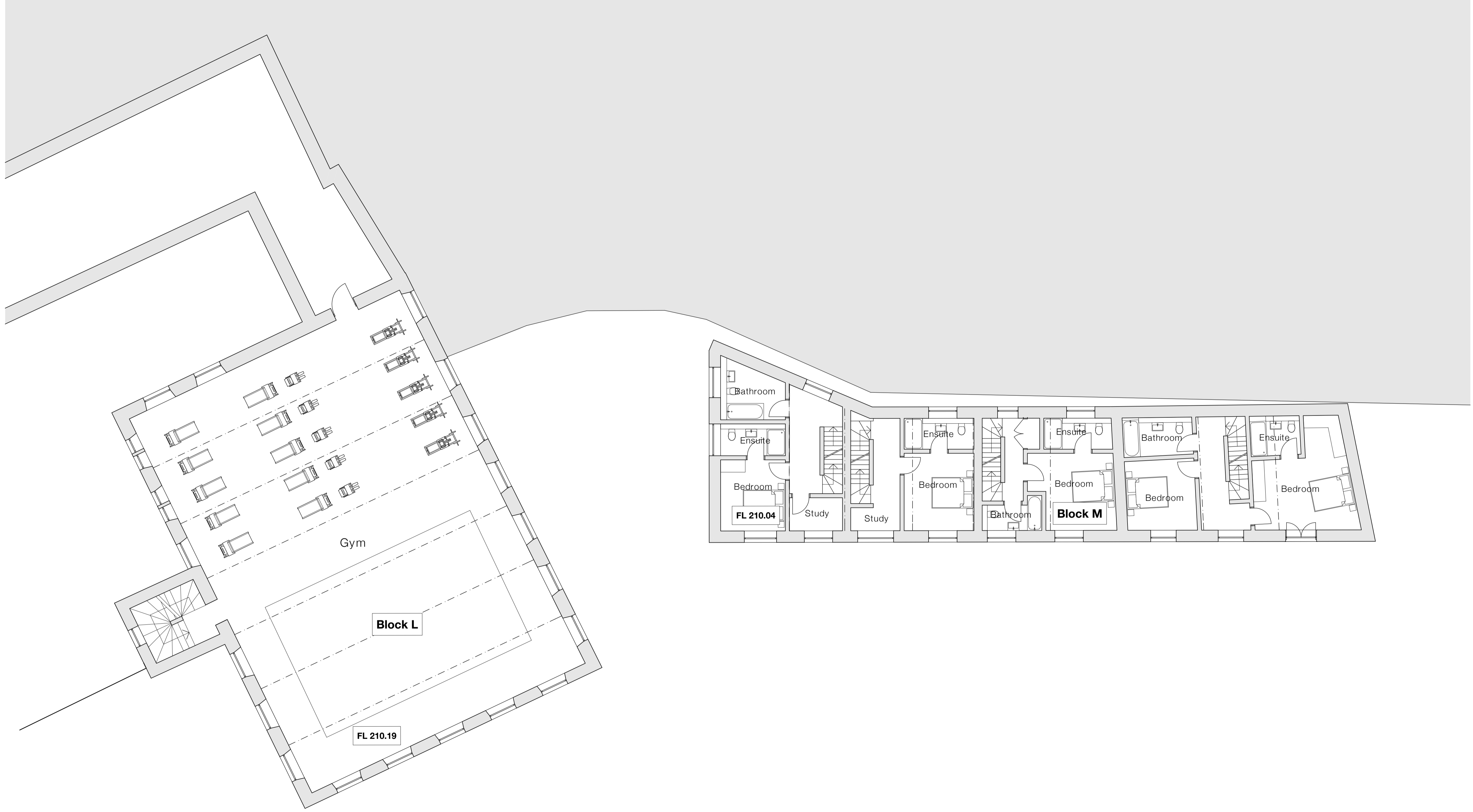
First Floor Plan 1:100