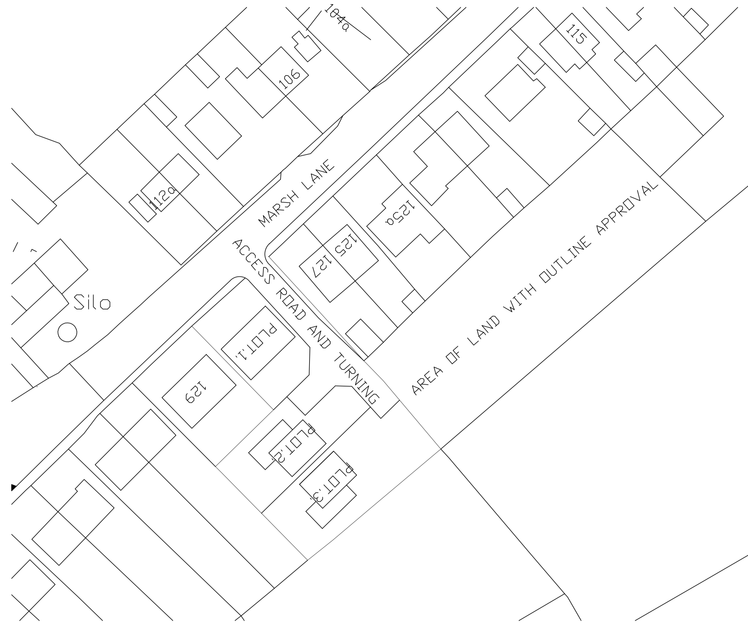
LOCATION PLAN SCALE 1:500