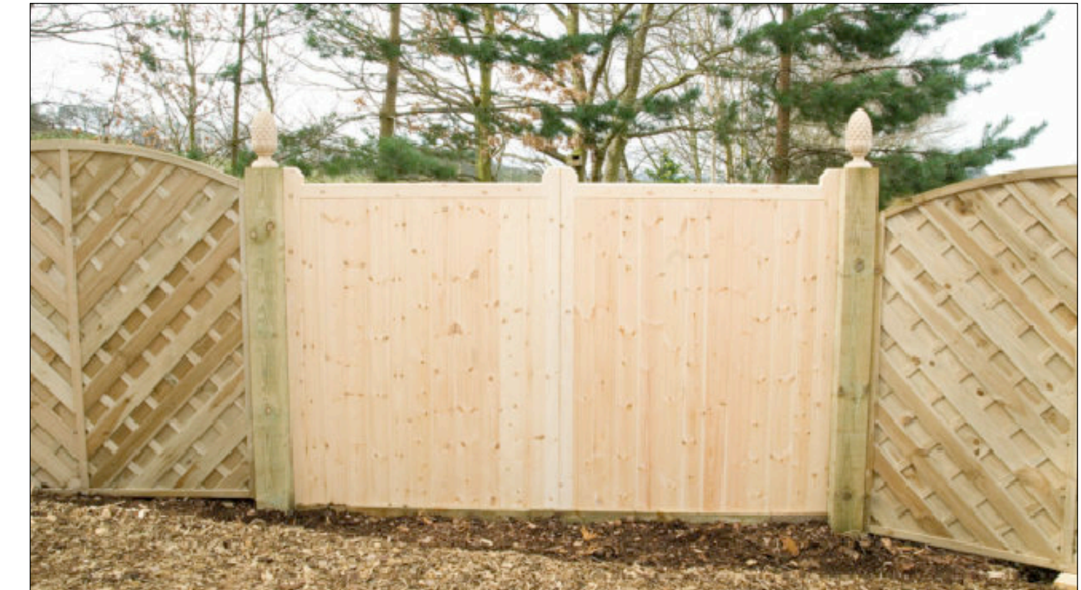
Example of gate style