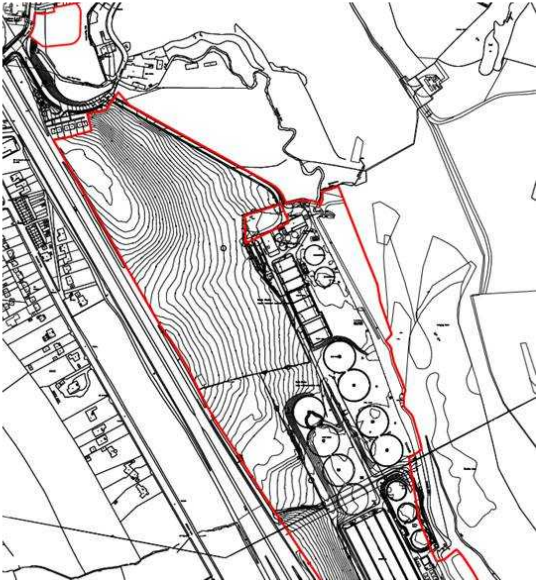
Site location plan extract