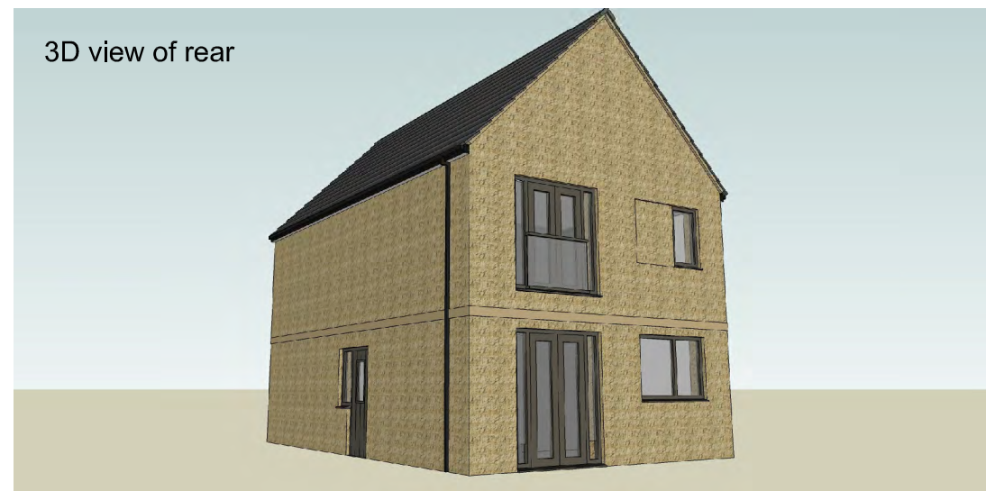
3D view of rear