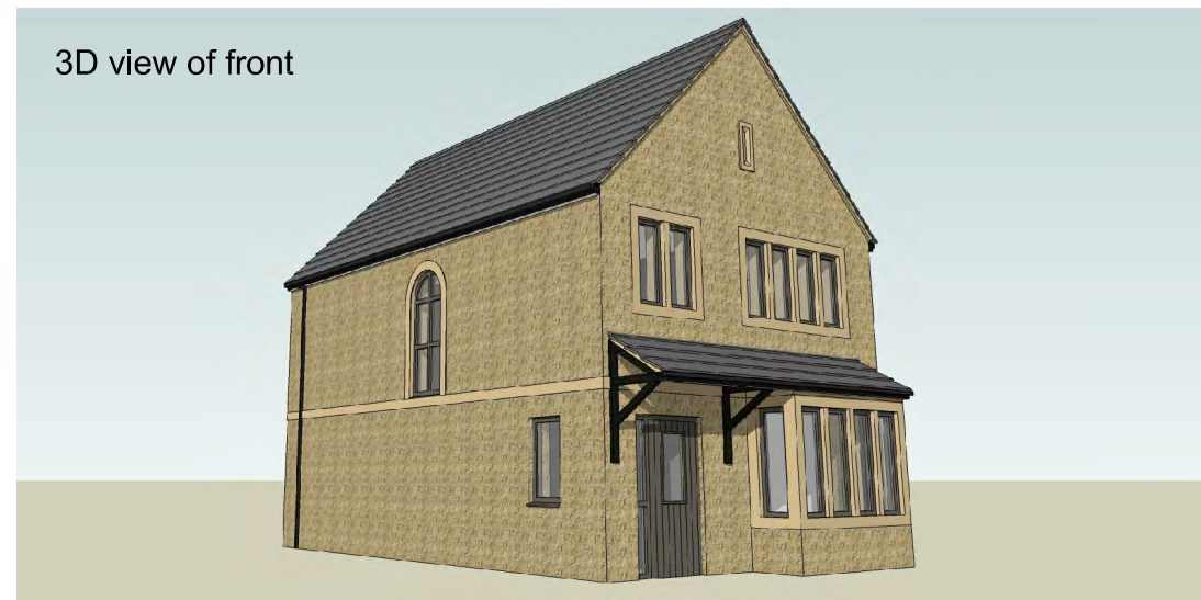
3D view of front