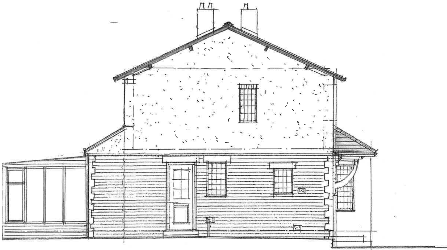
NORTH WEST (AS EXISTING)