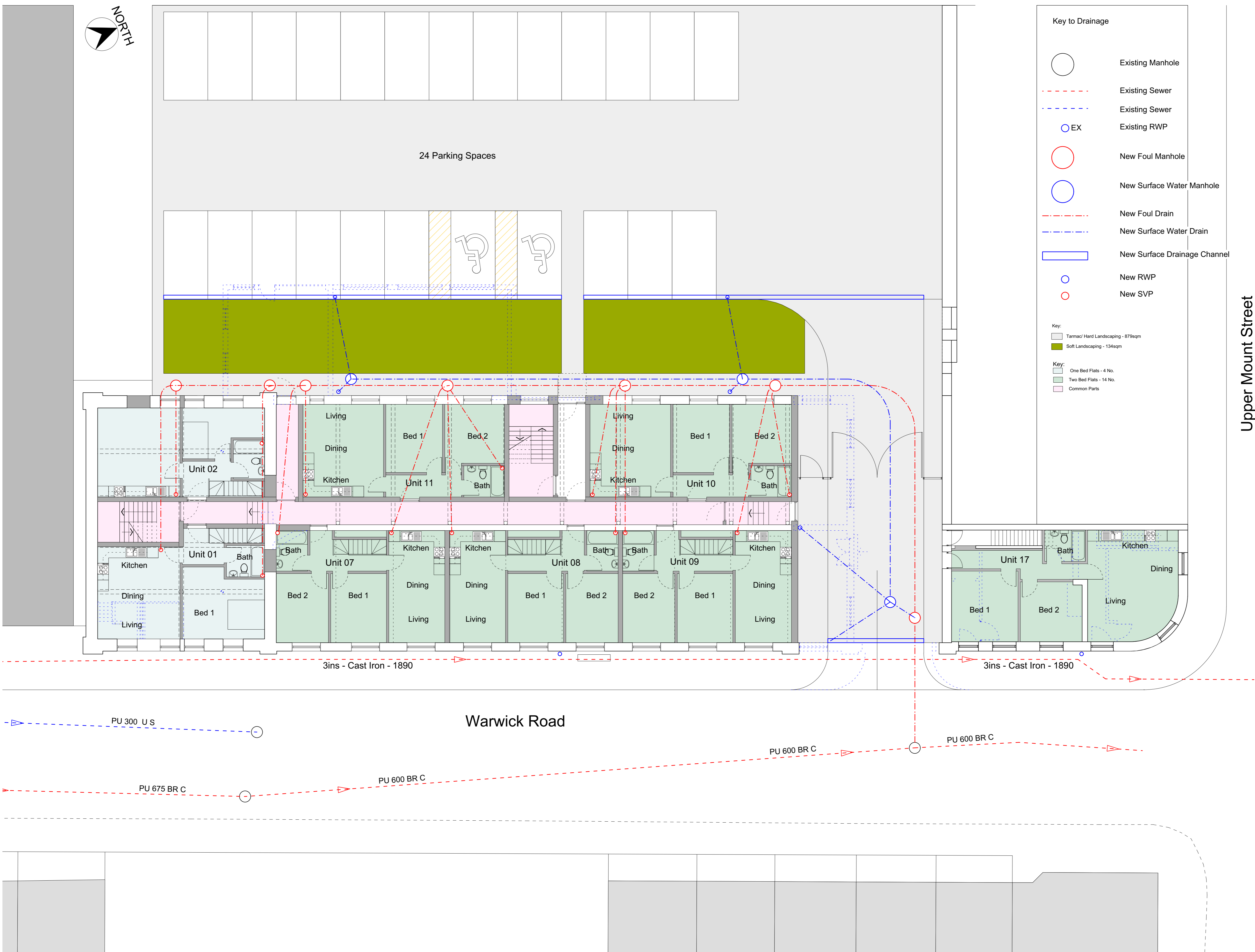
Ground Floor Site Plan As Proposed Scale 1:100