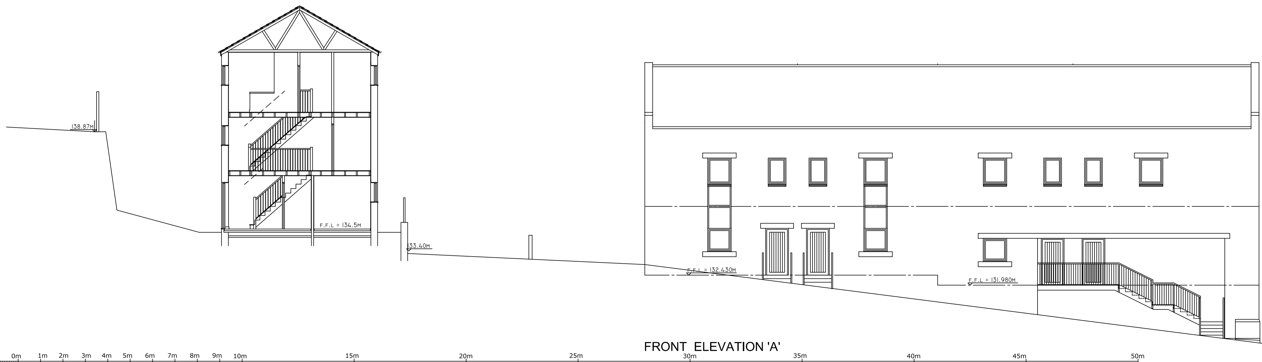
FRONT ELEVATION 'A'

THIS DRAWING IS FOR PLANNING PURPOSES ONLY, AND SUBJECT TO RE-SURVEY AFTER SURROUNDING STRUCTURES ARE DEMOLISHED