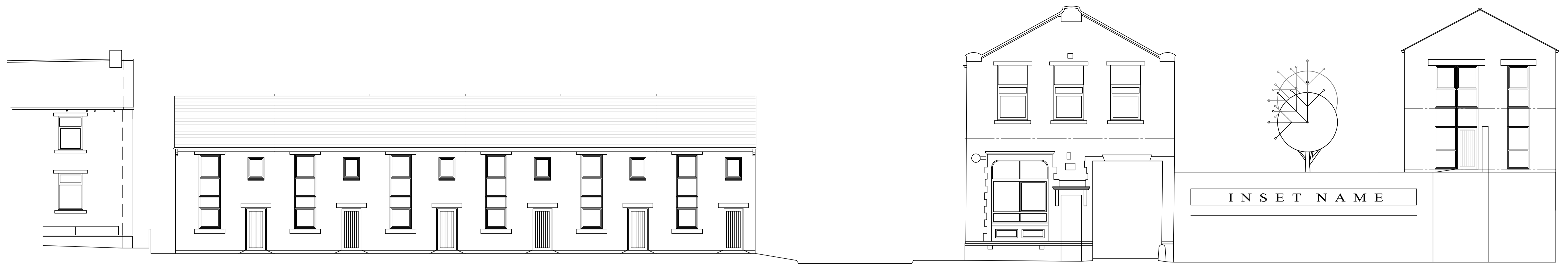
ELEVATION TO MANCHESTER ROAD

INSET STONE SIGN TO NAME & DATE ORIGINAL MILL & NEW DEVELOPMENT: DETAIL TO BE AGREED