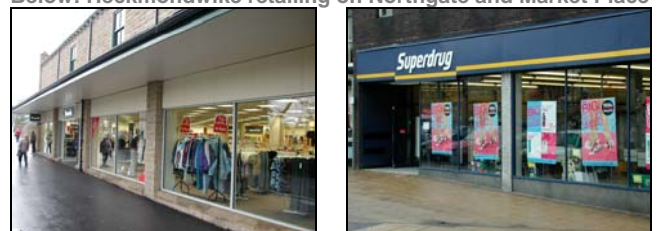
Below: Heckmondwike retailing on Northgate and Market Place