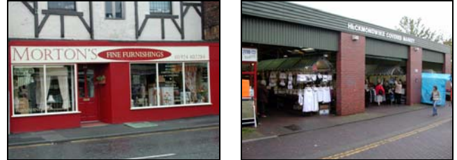
Below: Retail unit and covered market in Heckmondwike

An assessment of retailer demand, undertaken in August 2004, identified no registered retail requirements for representation in Heckmondwike. However, it is important to note that there may be retailers with a requirement for Heckmondwike who have not yet registered their interest.