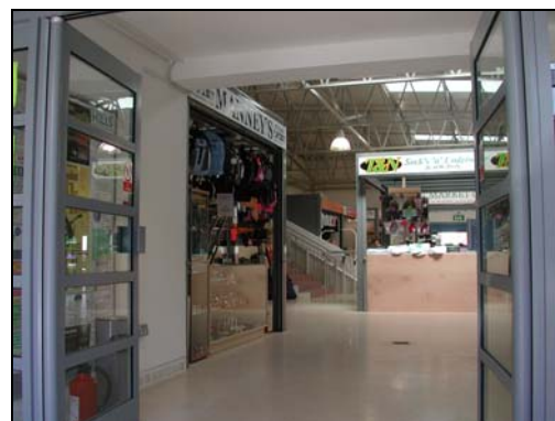
The re-furbished Market Arcade