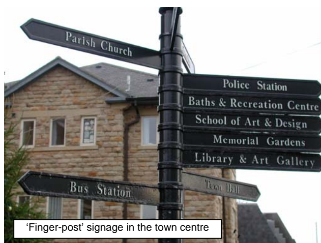
'Finger-post' signage in the town centre

The perception of environmental quality has also been adversely affected by the demolition and building works taking place on the Tesco site at the time of the 2003 assessment. The scores awarded for a number of indicators such as first impressions and building condition could have been influenced by the appearance of the building site from several locations around the town. Once building works are completed, and the 'gap' left by the removal of the old Tesco store is appropriately treated, the general environment of these areas is likely to improve again. Furthermore, the successful implementation of the proposed improvement scheme for the bus station area will also assist in raising Batley town centre's environmental quality.