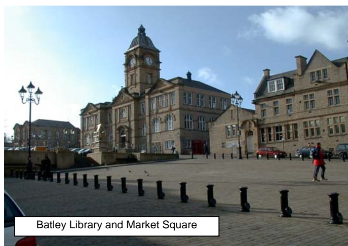
Batley Library and Market Square

Notwithstanding the above, the town as a whole does not score poorly on this indicator. Traffic signs and advertisement hoardings, although present within the study area, are rarely dominant enough to be a significant detraction from the overall street scene.