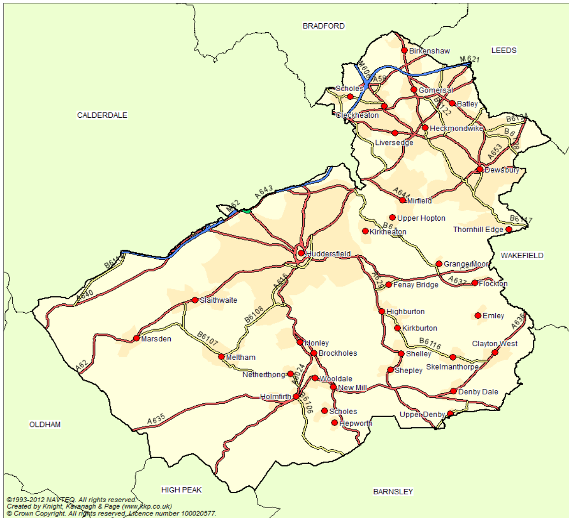
Figure 1 Kirklees Council main towns and villages

predominately white but with significant levels of people from black and minority ethnic groups, notably Asian and British Asian who make up 21% of the resident population.