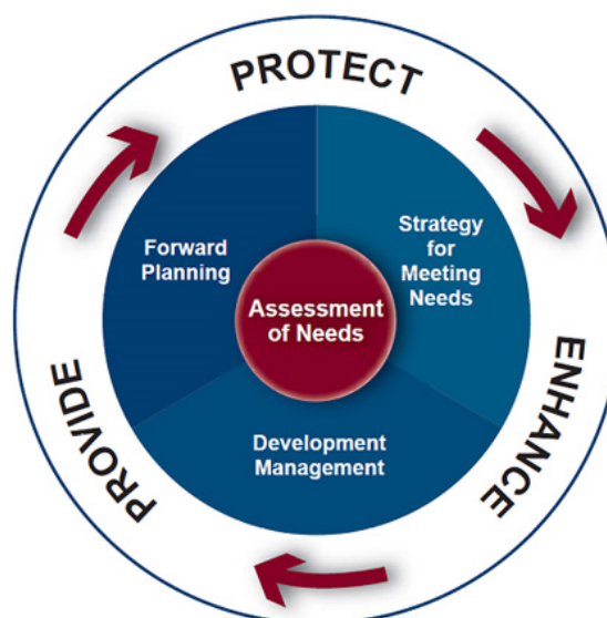
Figure 1: Sport England Strategic Planning Model

This Strategic Framework provides partners and stakeholders in Kirklees with a valuable tool to guide and prioritise internal and external investment decisions, support applications for external funding and inform key management decisions.