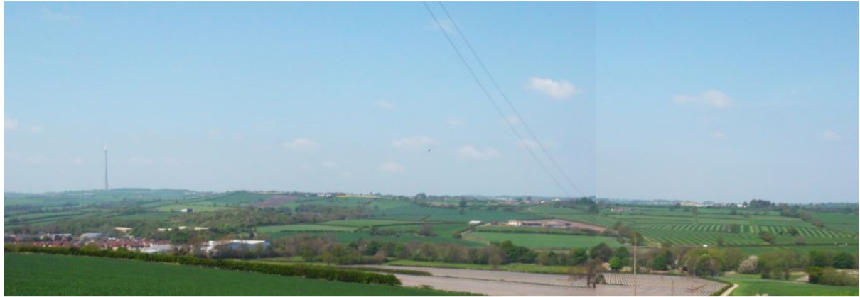
Existing view from Kirklees way looking north