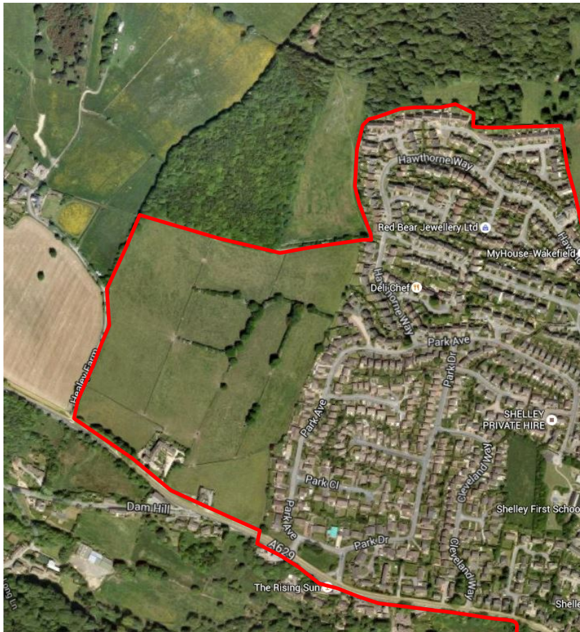
Figure 4: Proposed Green Belt boundary to the west of Shelley

The photos below illustrate the new Green Belt boundary: