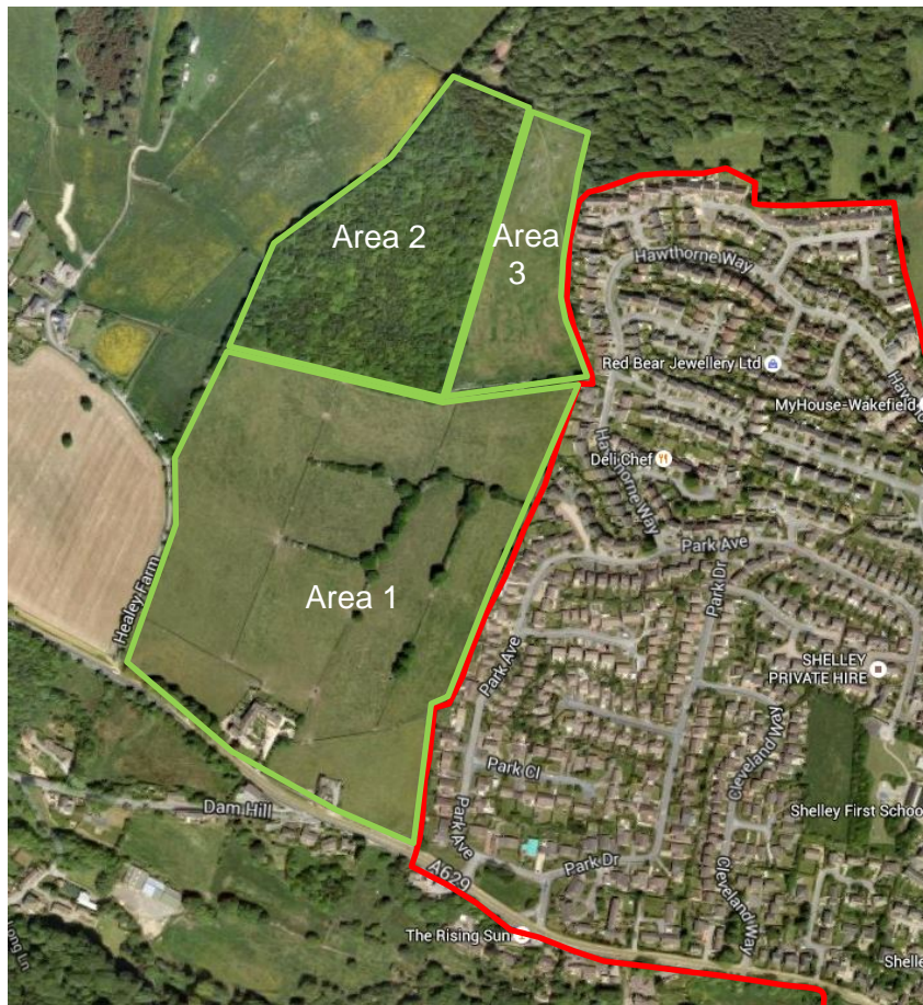
Figure 3: Area assessment of Green Belt to West of Shelley

This parcel of land can therefore be considered in isolation. This area contains Healey Greave Wood, an undulating area of open meadow and arable land.