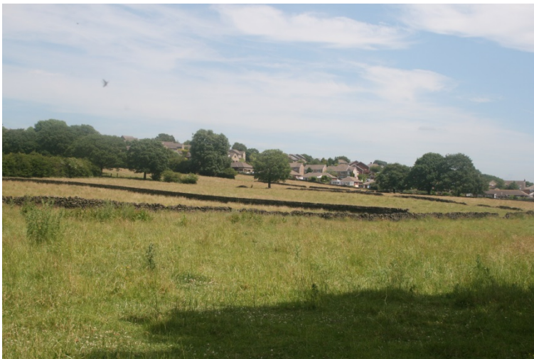
Photo 4: View eastwards towards Shelley from the western boundary of the site