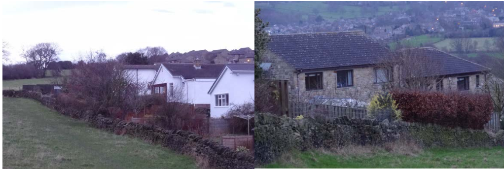
Photo 5: View of rear boundary wall of properties along Park Avenue and Hawthorne Way

The built form surrounding the site suggests that the existing Green Belt boundary is not one that is logical. The proposed new boundary would be defined by roads (A629 Penistone Road and Healey Farm access road which are both well-defined) and tracks (Box Ings Lane) which is clear and well defined by trees, hedgerows and walls). Healey Farm access road and Box Ings Lane also form the Trans Pennine Trail in this location. To the north the boundary would be formed by Healey Greave Wood and meadow with the boundary formed by woodland, wide tree belt and thick hedgerows and a well-defined footpath. This boundary would accord with the Framework and ensure that the Green Belt is clearly defined using readily recognisable features to ensure permanency reinforcing the urban context whilst providing a robust boundary for the future.