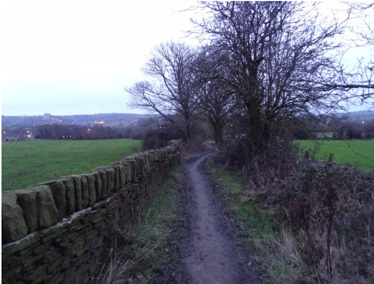
Photo 8: View along western boundary (Box Ings Lane / Trans Pennine Trail)