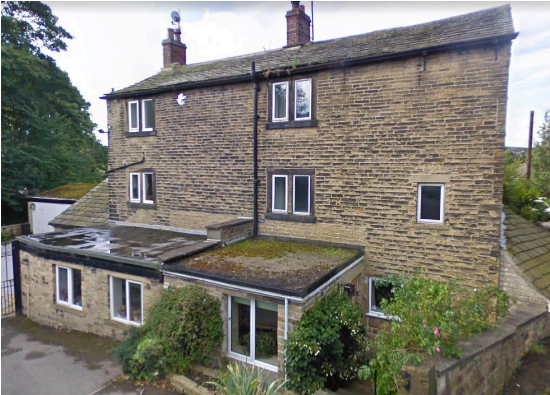
Figure 3 – 30/32 Gynn Lane rear elevation, compromised through 20 th Century single storey additions and uPVC Glazed windows.