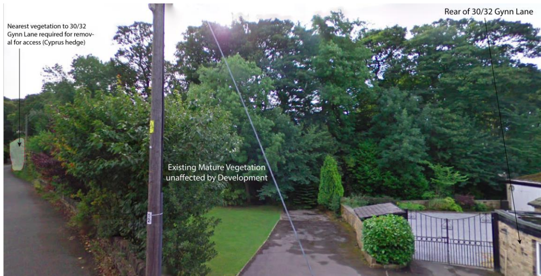
Figure 1 – View looking to site from rear elevation of 30/32 Gynn Lane