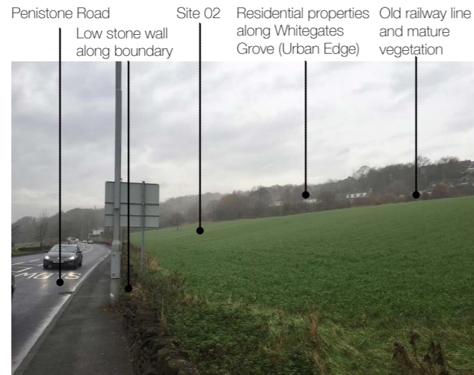
Site photograph looking to the north from Penistone Road at southern corner of Site 02