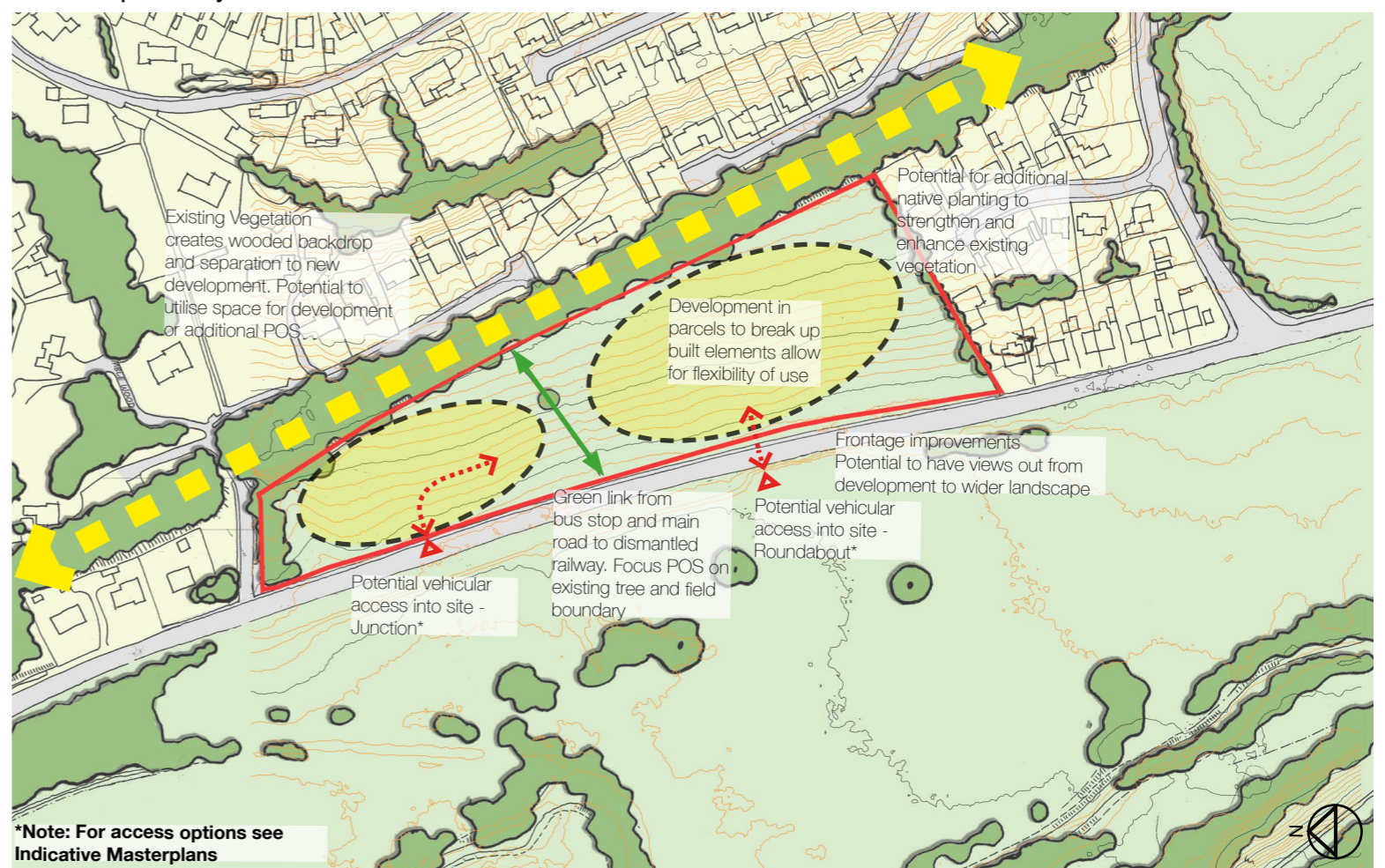
Landscape Opportunities and Structure Plan. NTS