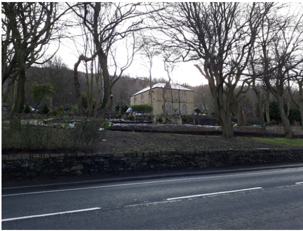
Plate 4. The vicarage from Manchester Road, looking south-west

4.9 By virtue of its listed status the Vicarage is of special architectural and historical interest, and is of a high level of heritage significance. Like the church, the vicarage derives most of its significance from its built form. Apart from its visual association with the contemporary church, the general setting of the vicarage is less important to its significance than is the case with the church as there is no particular historical association with vicarages and 'commanding positions'. However, as with the church, its general setting contributes in terms of aesthetic values and also in a small way in terms of historical value as the vicarage was also, presumably, built on former agricultural land donated by Sir Joseph Radcliffe .