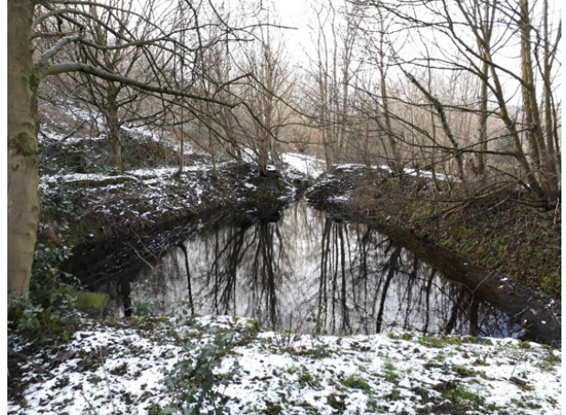
Plate 2. The reservoir at the eastern end of the site, looking west