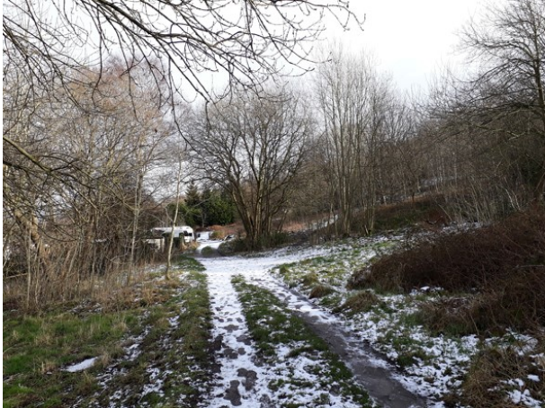
Plate 1. Overview of the site, looking east