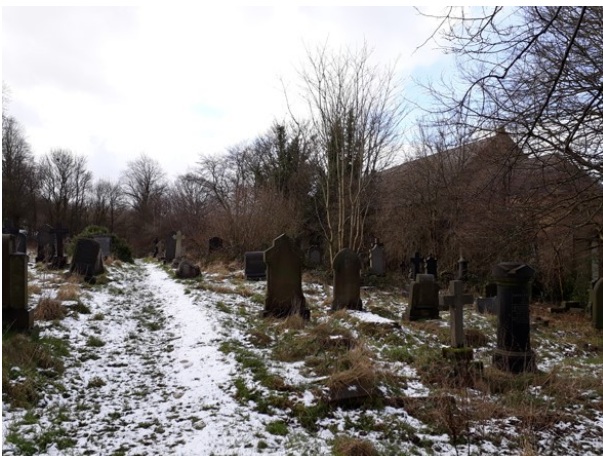
Plate 3. Looking towards the site from the churchyard, looking west