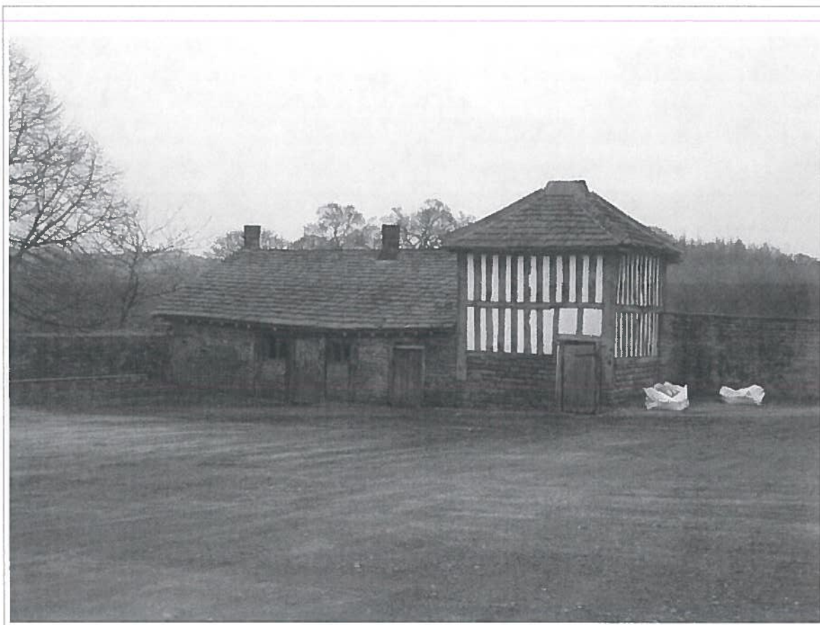
Woodsome Hall-out building

Fuel store – Circa 15 th century - List Entry Number: 1135321