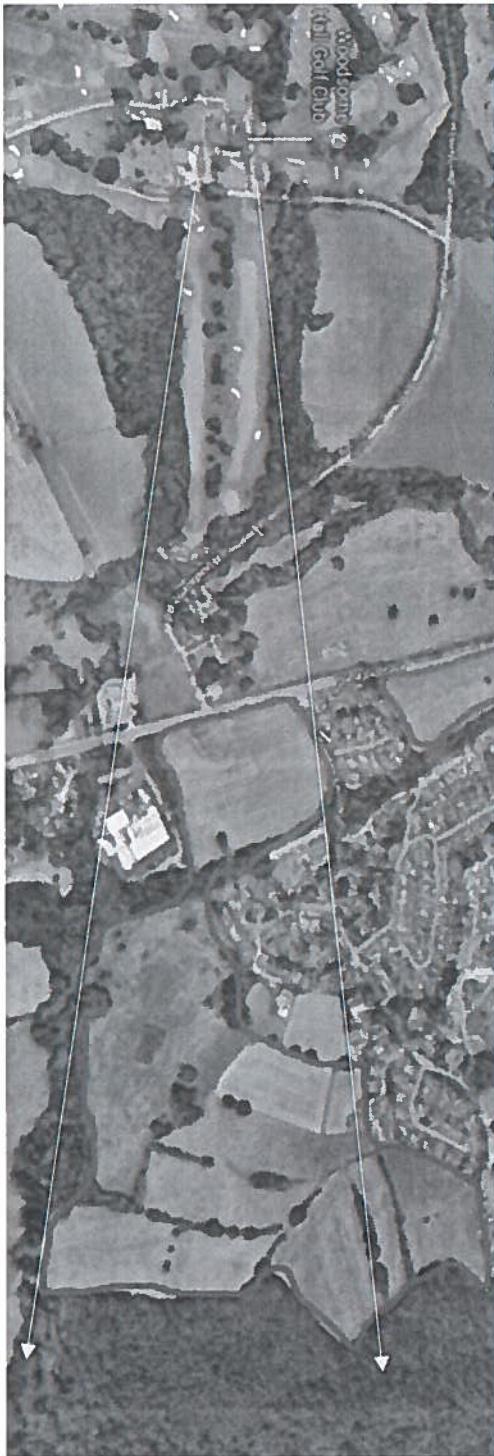
Figure 2. Woodsome valley/ hall/ sites orientation

Sight lines from the grade 1 listed hall = yellow