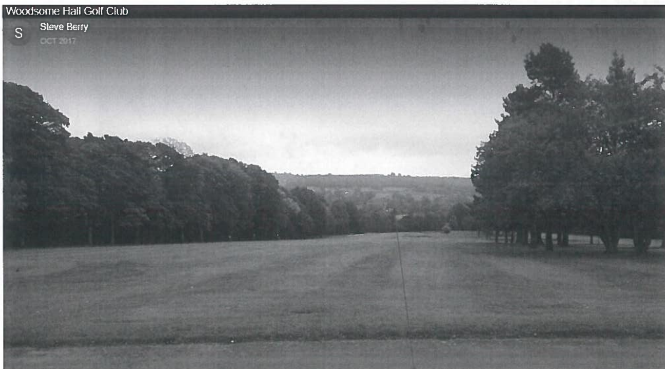
Steve Berry Oct 2017- APPRECIATING THE VIEW OF H2684A AND H2730A .

THE VIEW OVER H2684A AND H2730A AS CAPTURED BY VISTORS