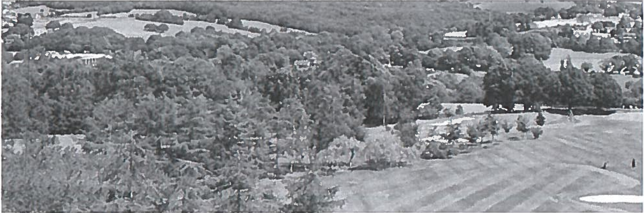
H2730a and H2684a

Elevated view of H2684a and H2730a from tee 5, Highburton to the right. This view point depicts how important the sites are to Lepton (ancient) great wood within the valley setting.