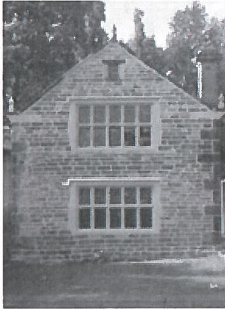
Crowtrees old hall Grade 2 listed