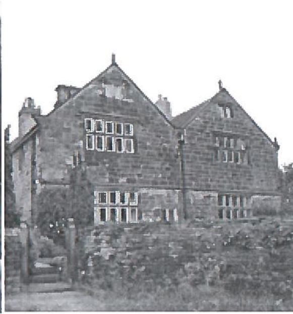
Woodsome lees old manor house grade 2 listed