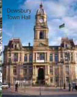
Dewsbury Town Hall