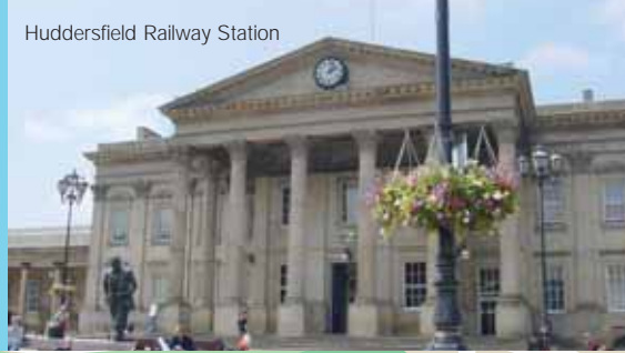
Huddersfield Railway Station