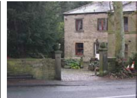
Ball Finials on Gatepiers at the entrance to Wilshaw Villa