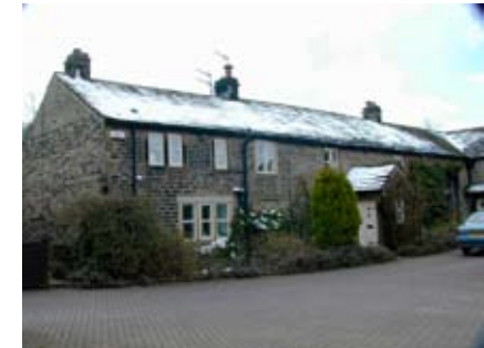
Gill Birks Farmhouse