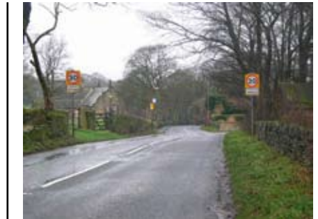
Gateway view along Wilshaw Road

The vicarage (D) sits on a deflected view and is set back from the roadside in a woodland setting. This continues across Wilshaw Road and leads to a landscaped triangular plantation. This area is characterised by attractive landscaping, stone boundary walls and traditional ironwork, and could be enhanced by