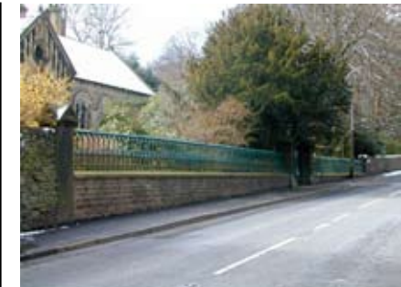
Gatepiers and railings