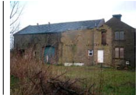
Manor House Barn

Most of the buildings in Wilshaw are in a relatively good condition. However, the barn at Manor House requires repair and restoration and a sustainable new use should be identified. The timber garage at the eastern gateway of the Conservation area could also benefit from some enhancement, especially as it is situated in such a prominent gateway position.