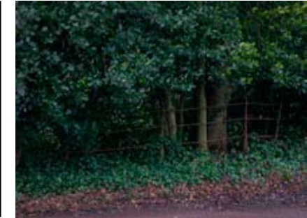
Locally distinctive ironwork at the Plantation

There is potential to improve existing elements of street furniture such as street lighting, road signage, utilities service equipment and a scheme to reintroduce traditional street surfaces could be beneficial.