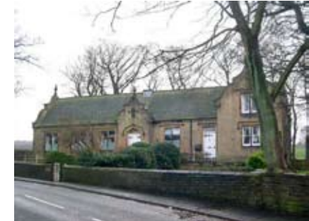
St. Mary's School and School Masters House