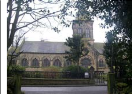
Church of St. Mary

The gatepiers and gates of the Church of St Mary are also listed and date from the same period as the church. They are a large pair of square ashlar gate piers and have triangular pedimented caps with very heavy cast iron gates with arched rails and dog rails. The terminating piers are at a height which fits the