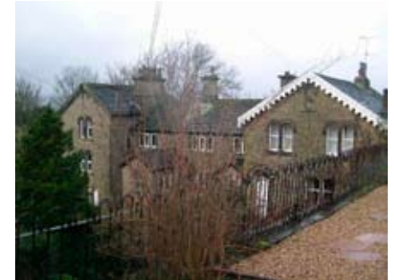
Buildings at Lower Greave

There are a number of reoccurring architectural features within the conservation area largely as a result of the use of one architect, John Kirk; these include the round arched panels at the top of the chimney, the eaves of the church tower, entrance, gable walls and gatepiers. This detail is picked up in the design of the barge boarding found on various buildings such as the Manor House and associated buildings along with the almshouses. Large quoin stones and kneelers are also a common feature of some of the important buildings in the area. The lack of architectural embellishment on the terraced housing at Upper Wilshaw and the houses at St Mary's Court is a reflection of the function and status of the buildings at the time of construction. In contrast, the barn at Manor House has considerable architectural detailing for its function and reflects the importance and status of this group of buildings and the prominence of Lower Greave prior to the influence of Joseph Hirst.