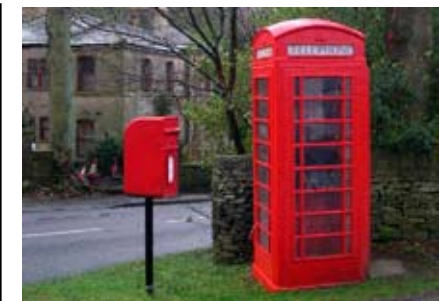
K6 telephone kiosk and Post Box