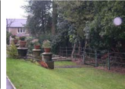
Manicured graveyard with associated detail

The open spaces of the moorland and agricultural fields are an important buffer to the conservation area and enhance its setting, maintaining the historic rural character of the area. The graveyard is a secluded open space and large well tended gardens contribute to the character of the area.