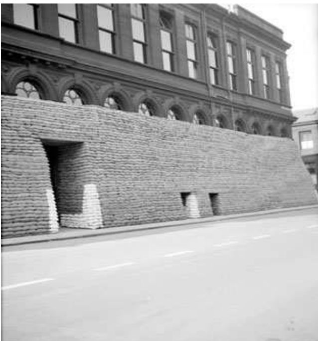
Left: The Town Hall protected with sandbags in 1940