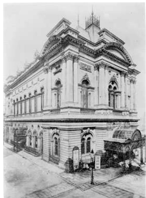
Princess Street Entrance c1900