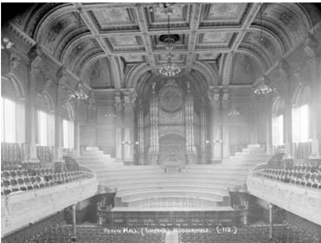
The Concert Hall c1910