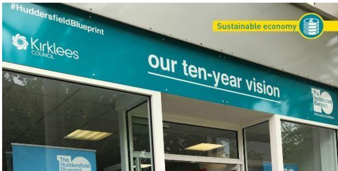
The Huddersfield Blueprint Shop