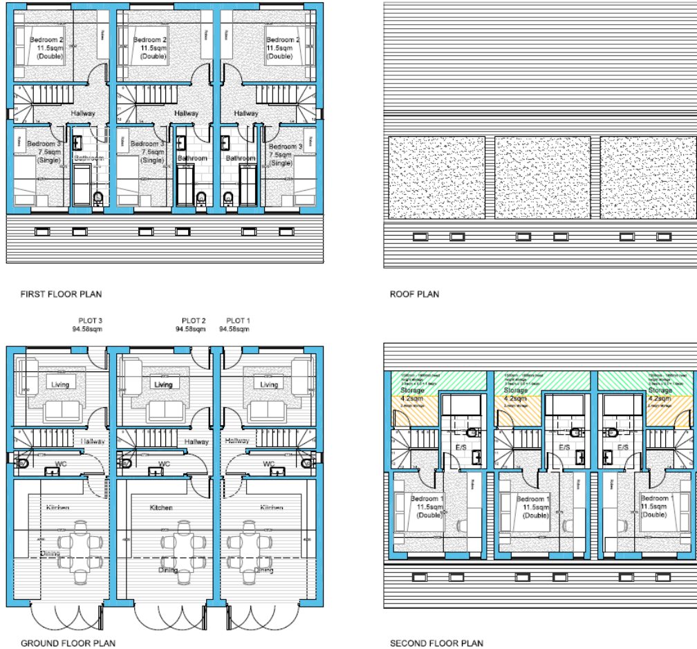
Figure 3 - Floorplans as proposed

3.1 The proposal seeks full planning permission to secure residential development for 3 townhouse dwellings. Due to the site's location within the settlement framework, it is deemed that this constitutes as an infill development.