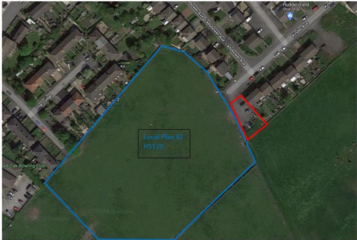
Figure 1 - Application site (edged red)