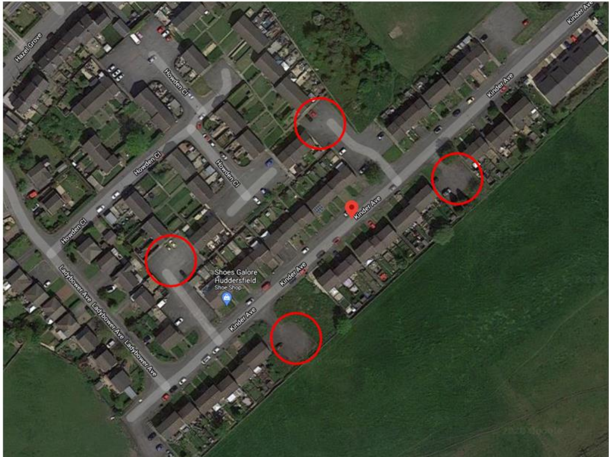
Figure 5 - Existing parking areas

from the property and serves 4 different bus routes providing access to Huddersfield along the A62. The commute is approximately 25 minutes to Huddersfield city centre with 4 buses running every hour.