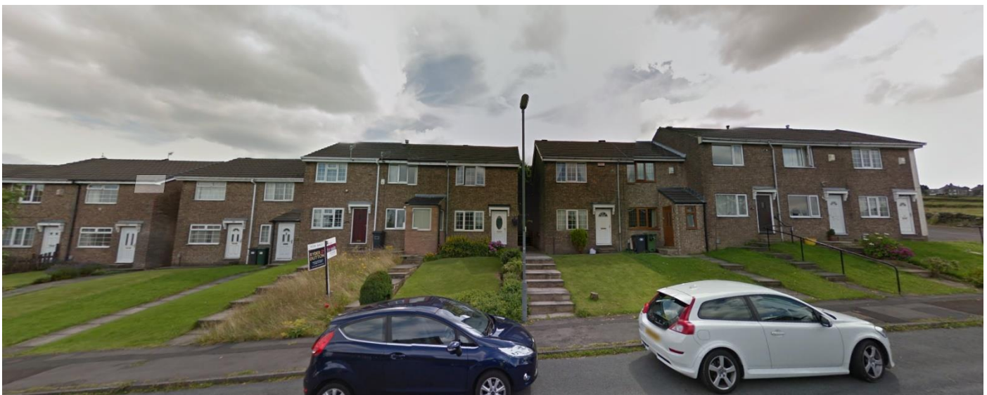
Figure 4 - Differing Ridge and Eave heights along Kinder Avenue