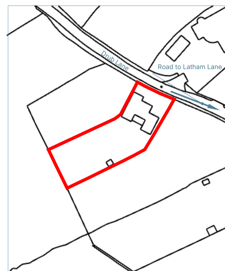
Location Plan as Existing - 1:1250