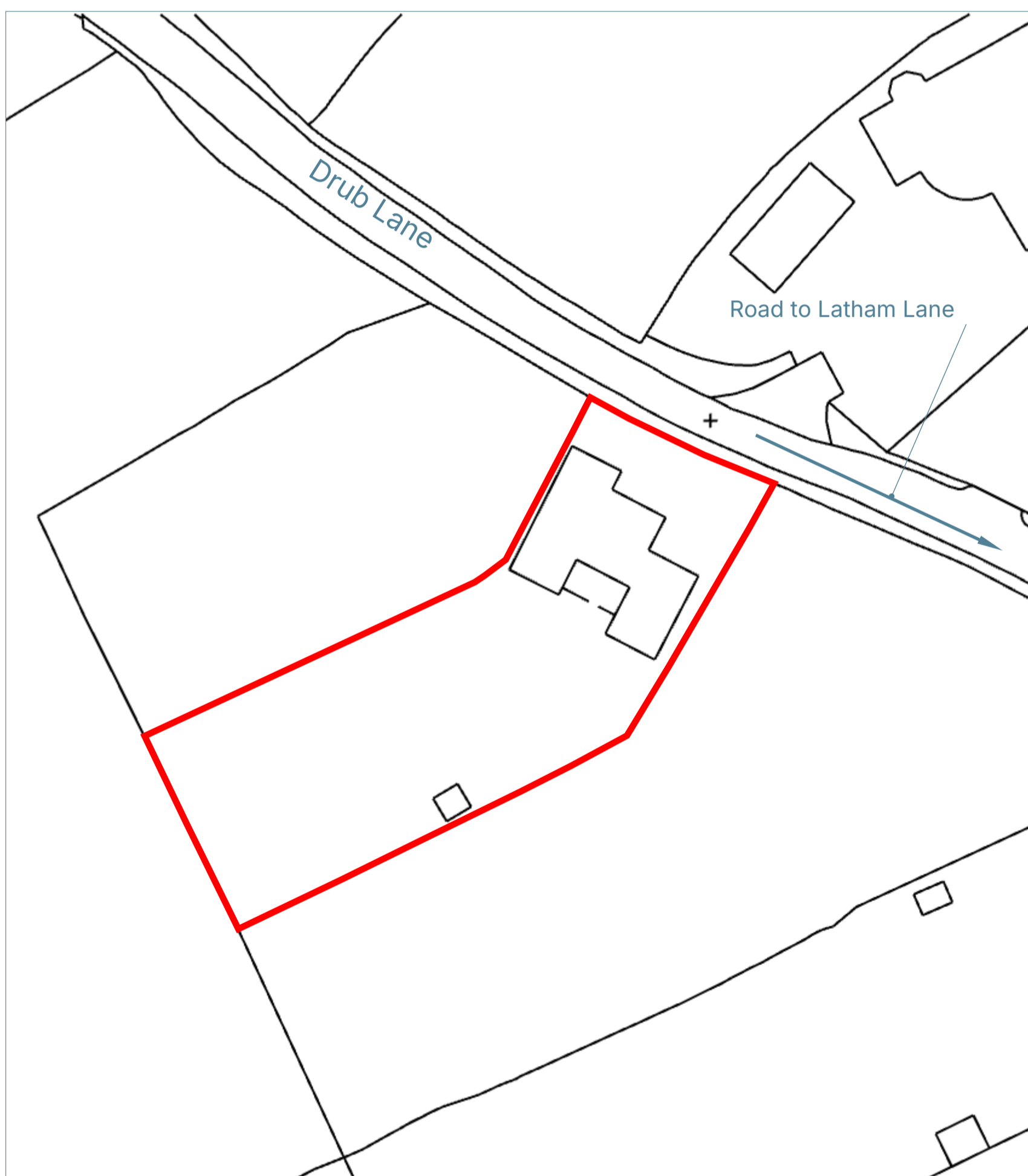
Site Plan as Existing - 1:500