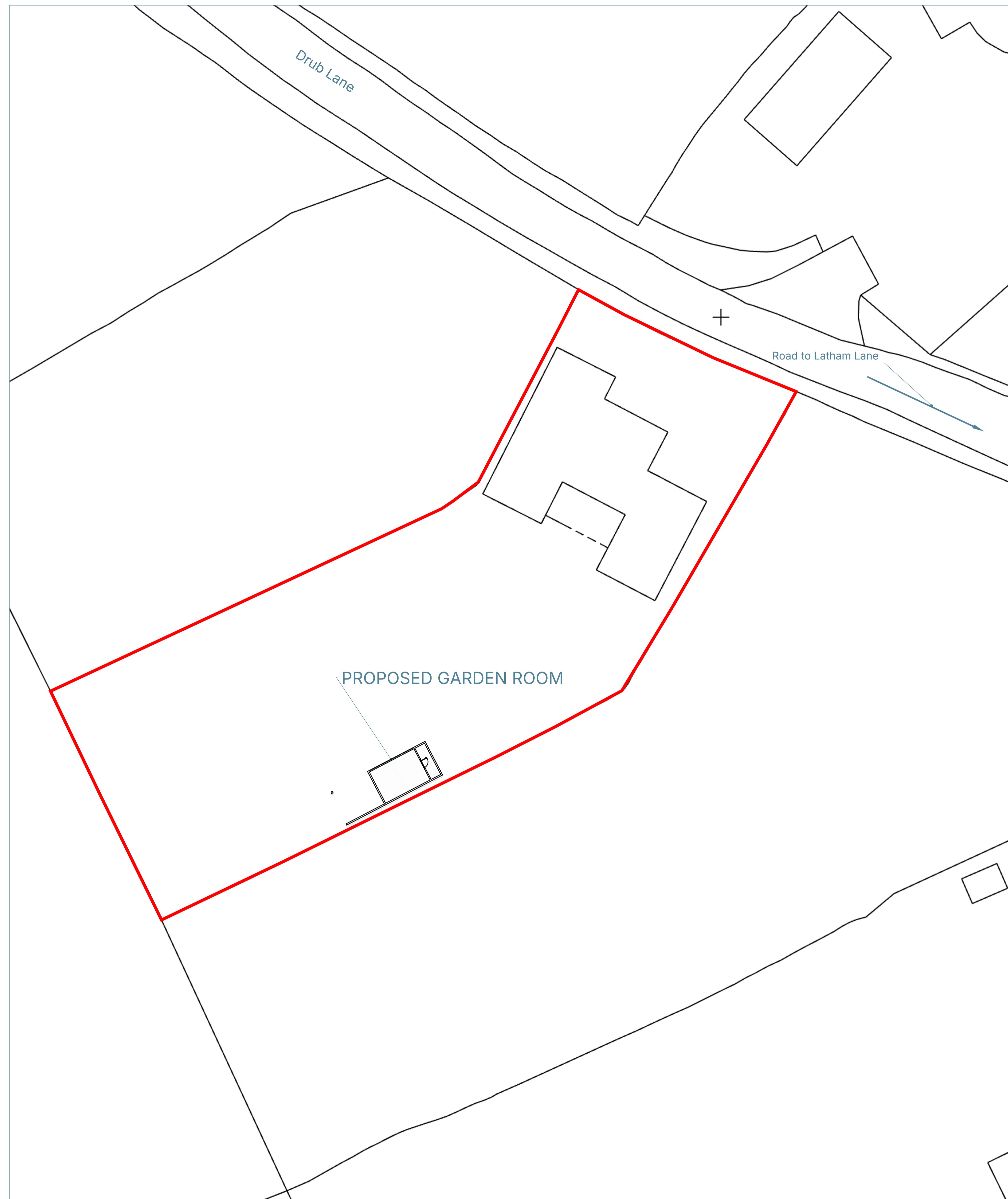
Site Plan as Proposed - 1:200