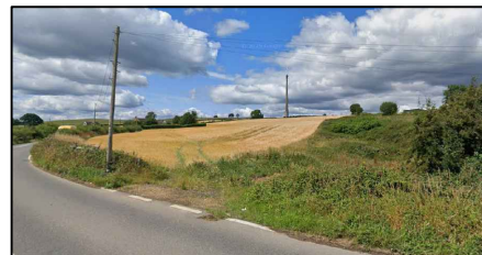
EXISTING SITE ENTRANCE UPGRADED