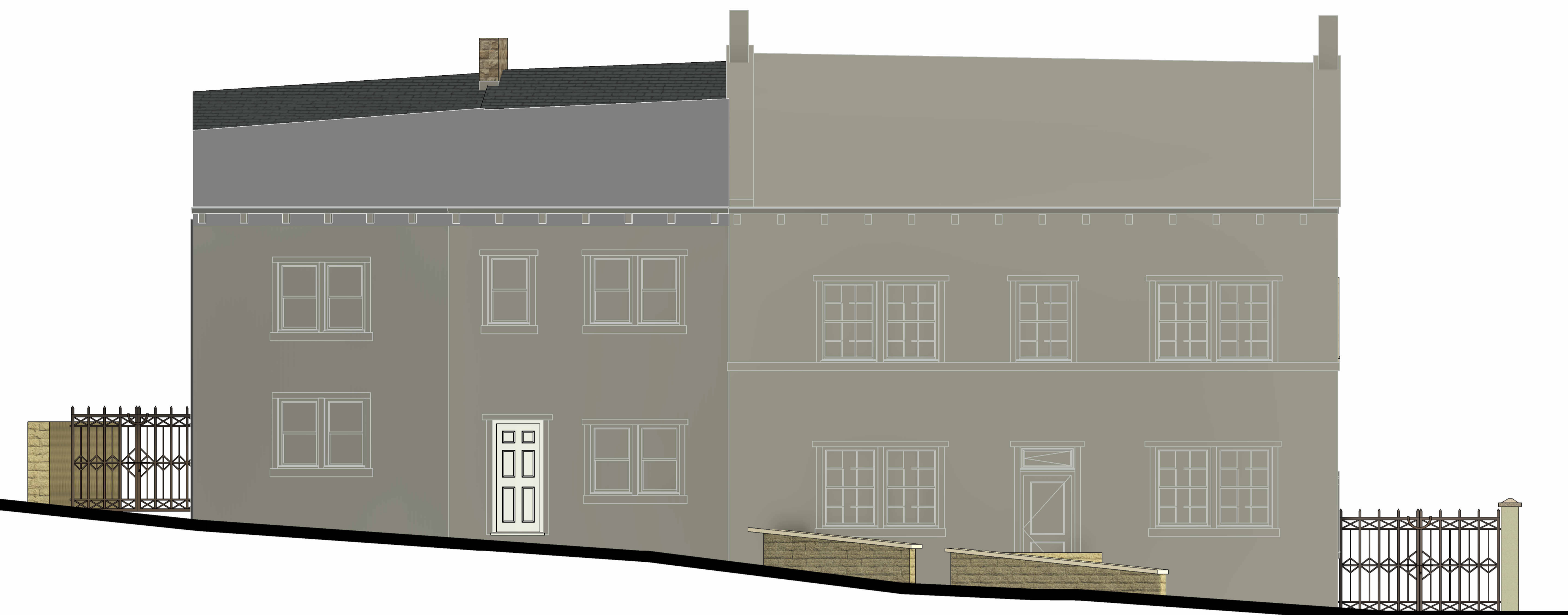
South-East Facing Elevation Materials