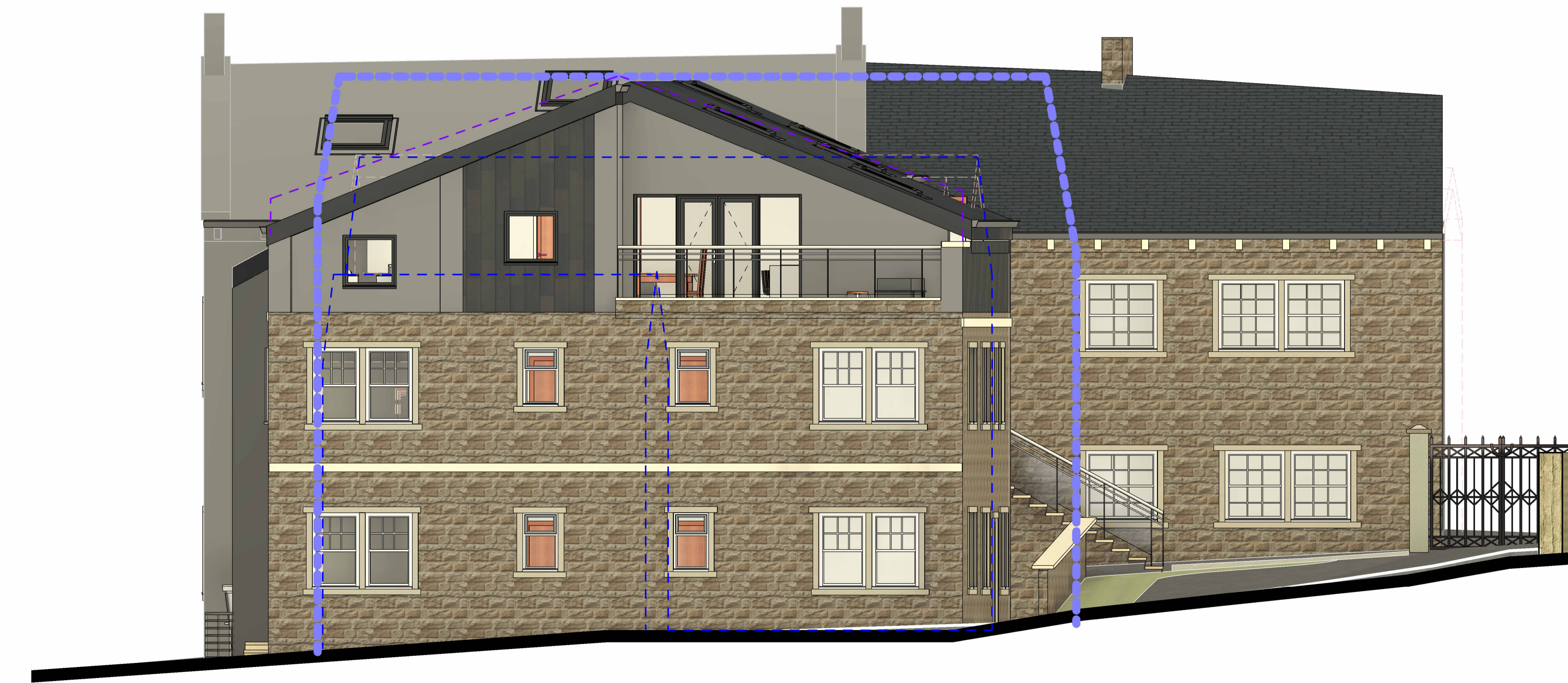
North-West Facing Elevation Materials