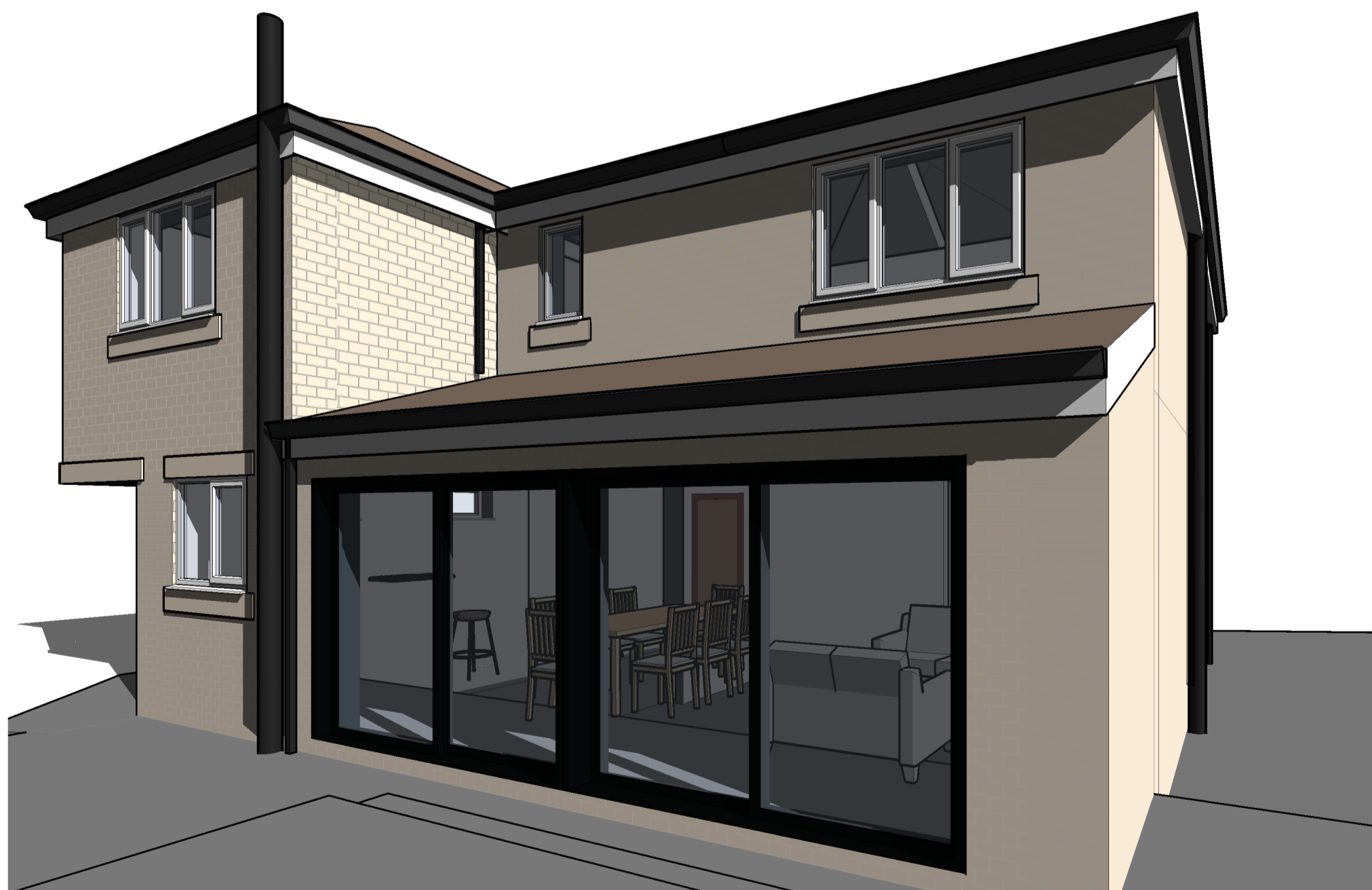
3D View 3