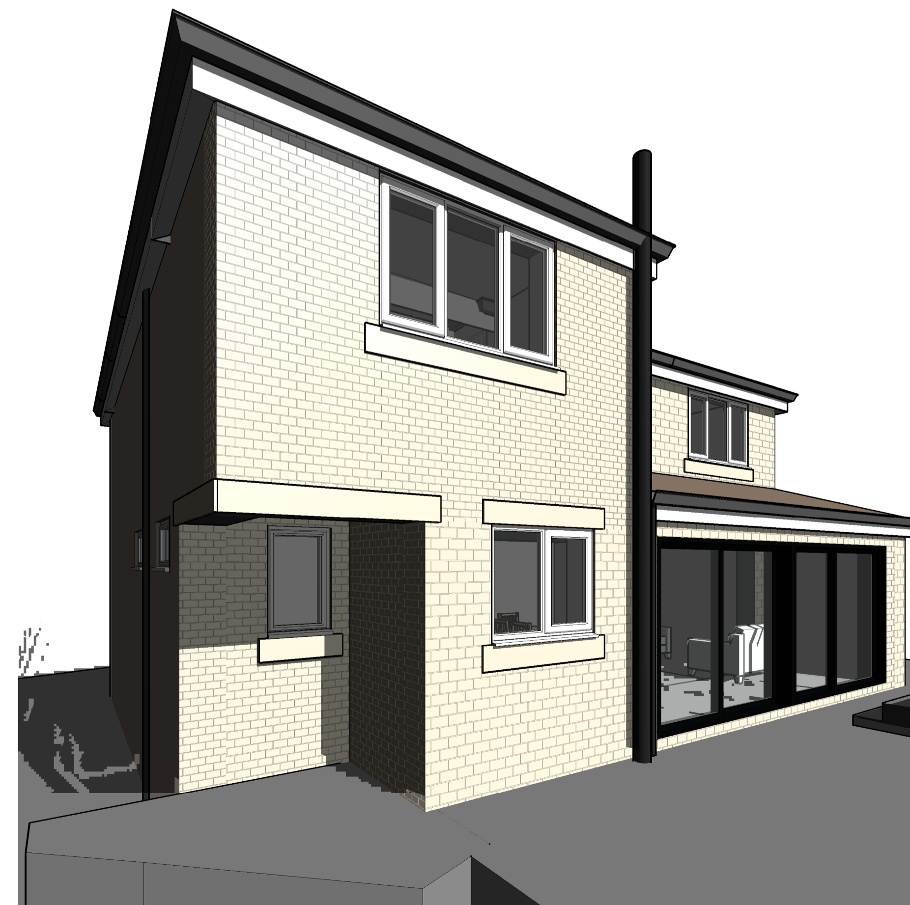
3D View 4