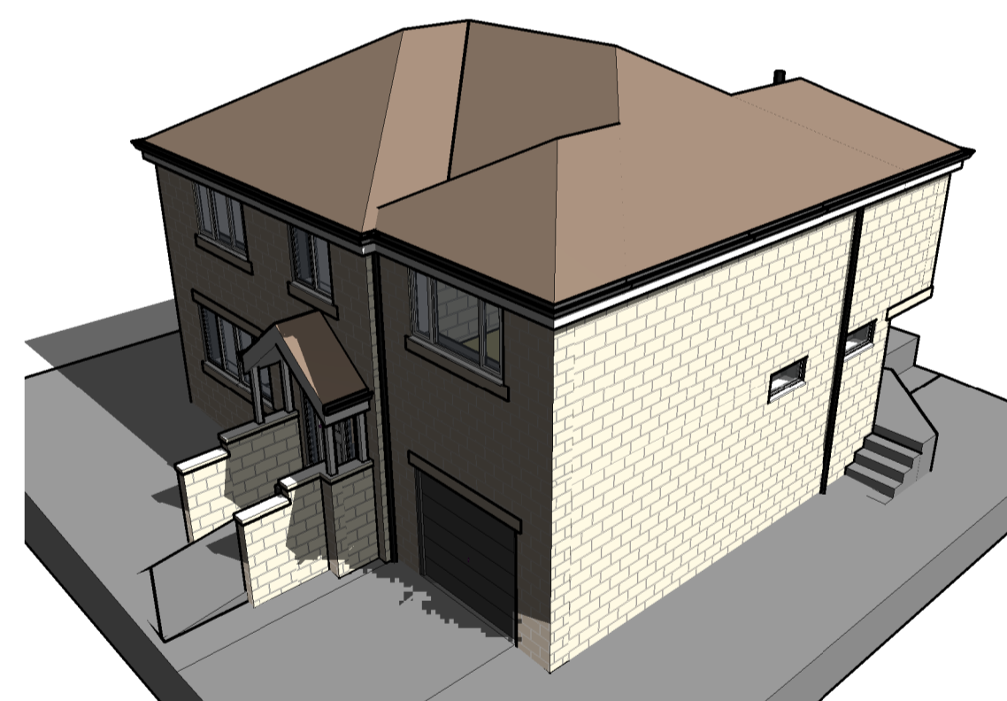
3D View 5