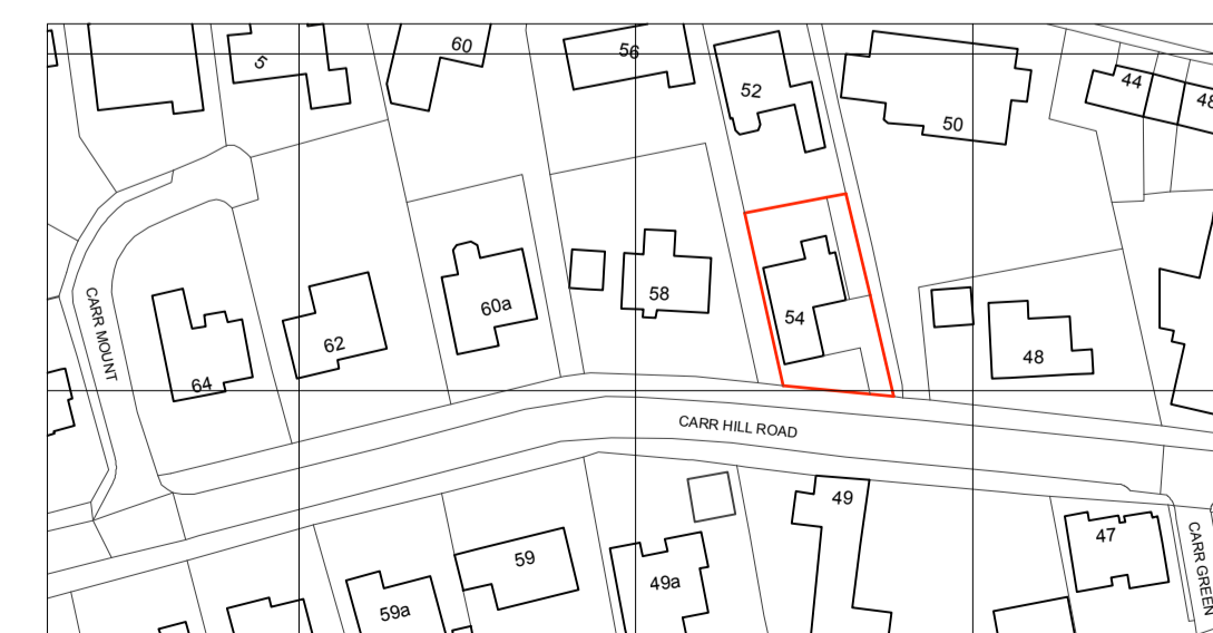
location plan scale - 1:1250

This drawing has been prepared specifically for the purpose of obtaining Planning Permission and/or Building Regulation Approval. Its suitability for other purposes, without supplementary details and specifications cannot be guaranteed. The Permissions and/or Approvals are beyond the Architects control, and no guarantee that such will be granted is given or to be inferred by reason of the preparation of this drawing.