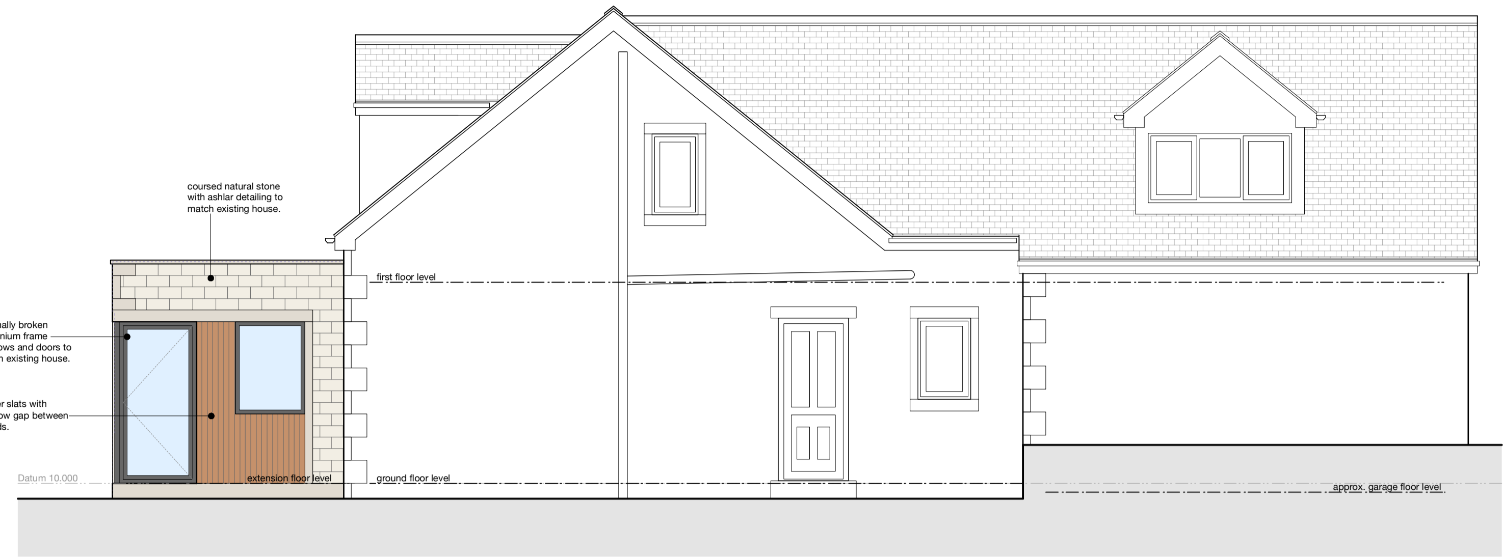
west elevation - side