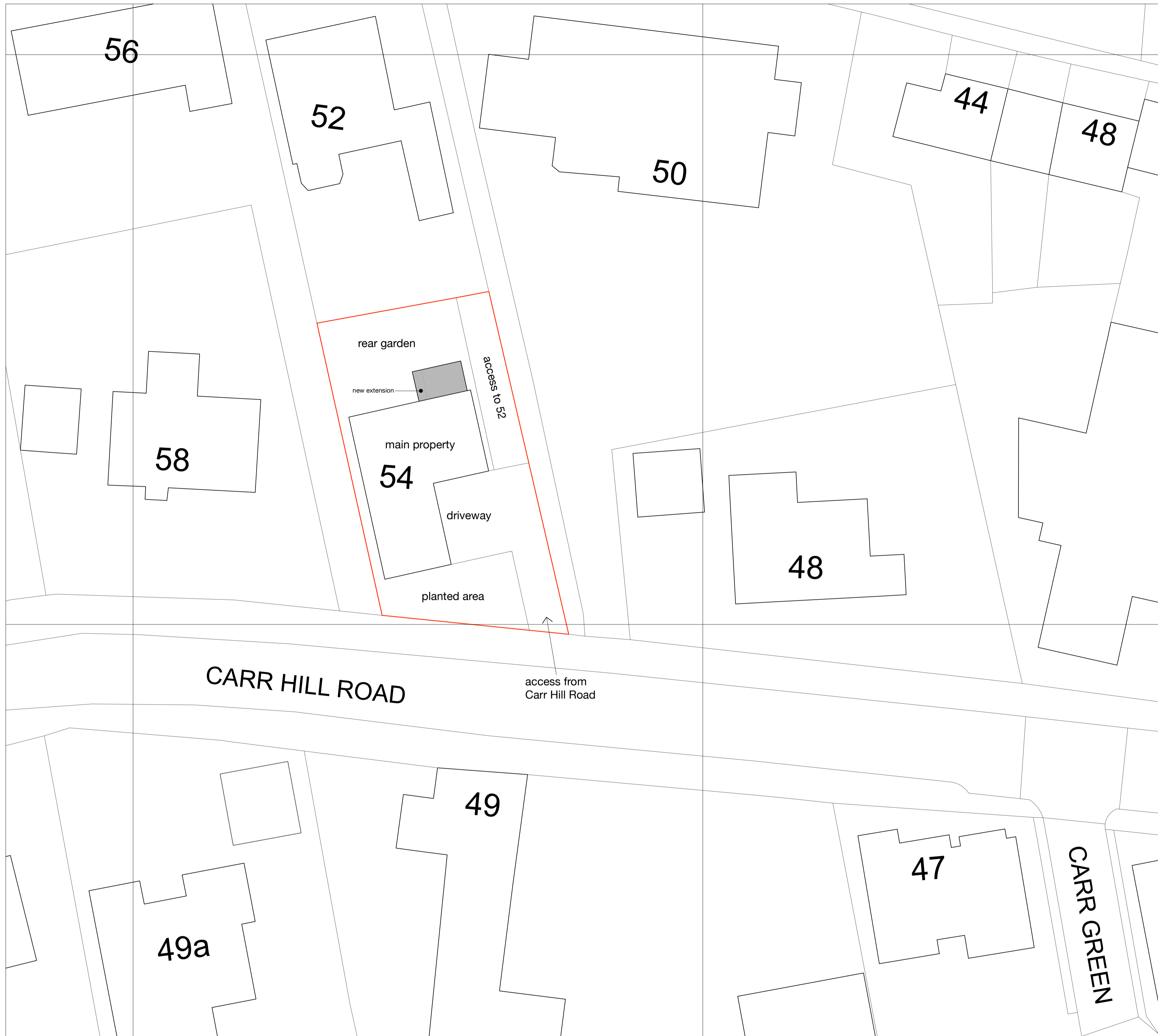
block plan scale - 1:200