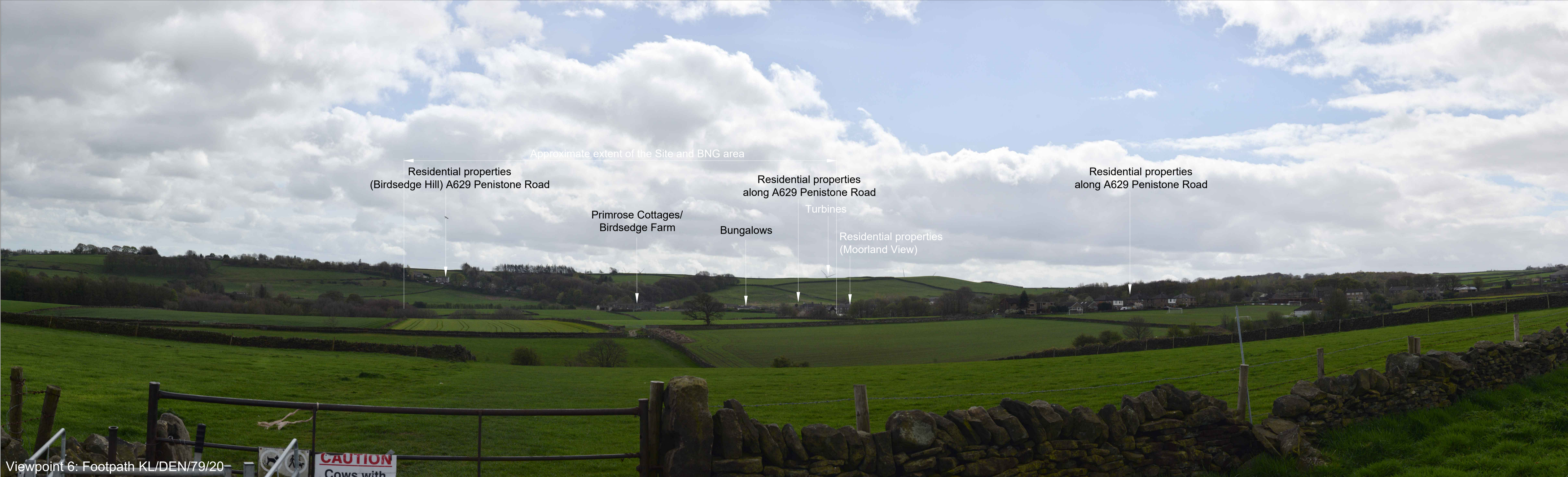
Viewpoint 6: Footpath KL/DEN/79/20