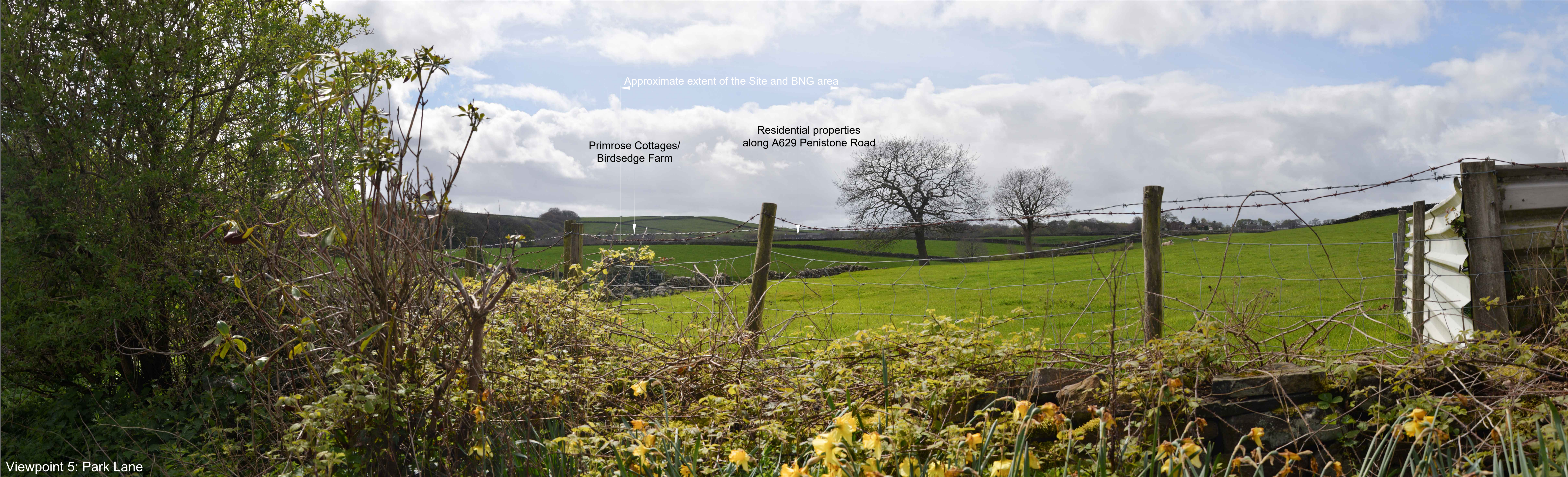
Viewpoint 5: Park Lane