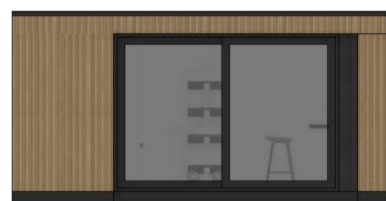
Front Elevation as Proposed Scale 1:50@A1