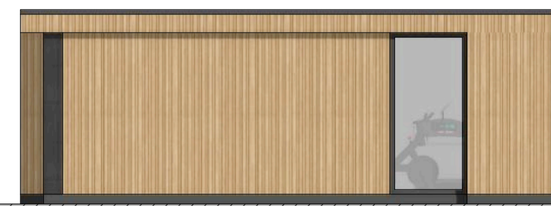
Right Elevation as Proposed Scale 1:50@A1