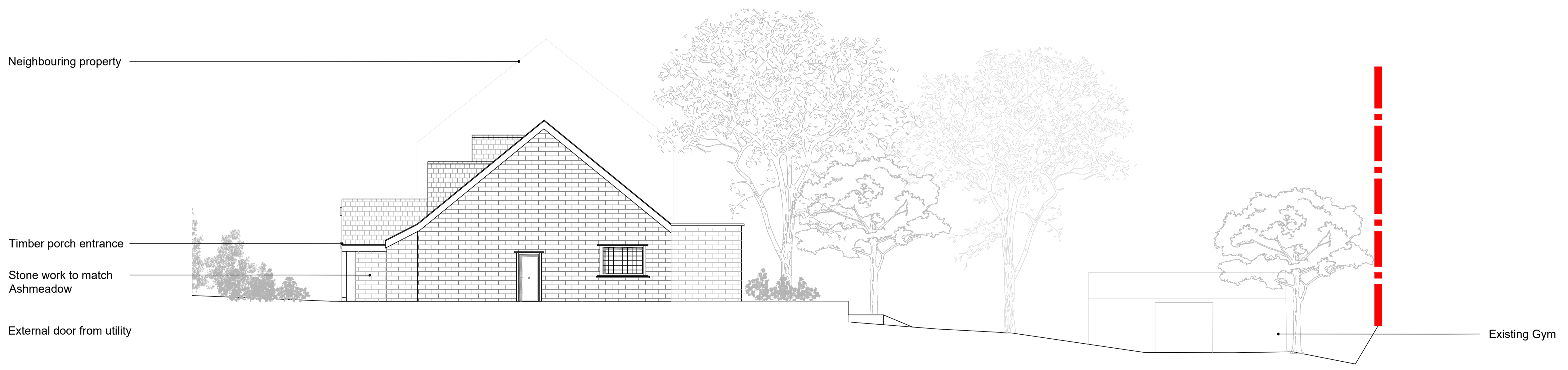
Proposed East Elevation Scale 1:100