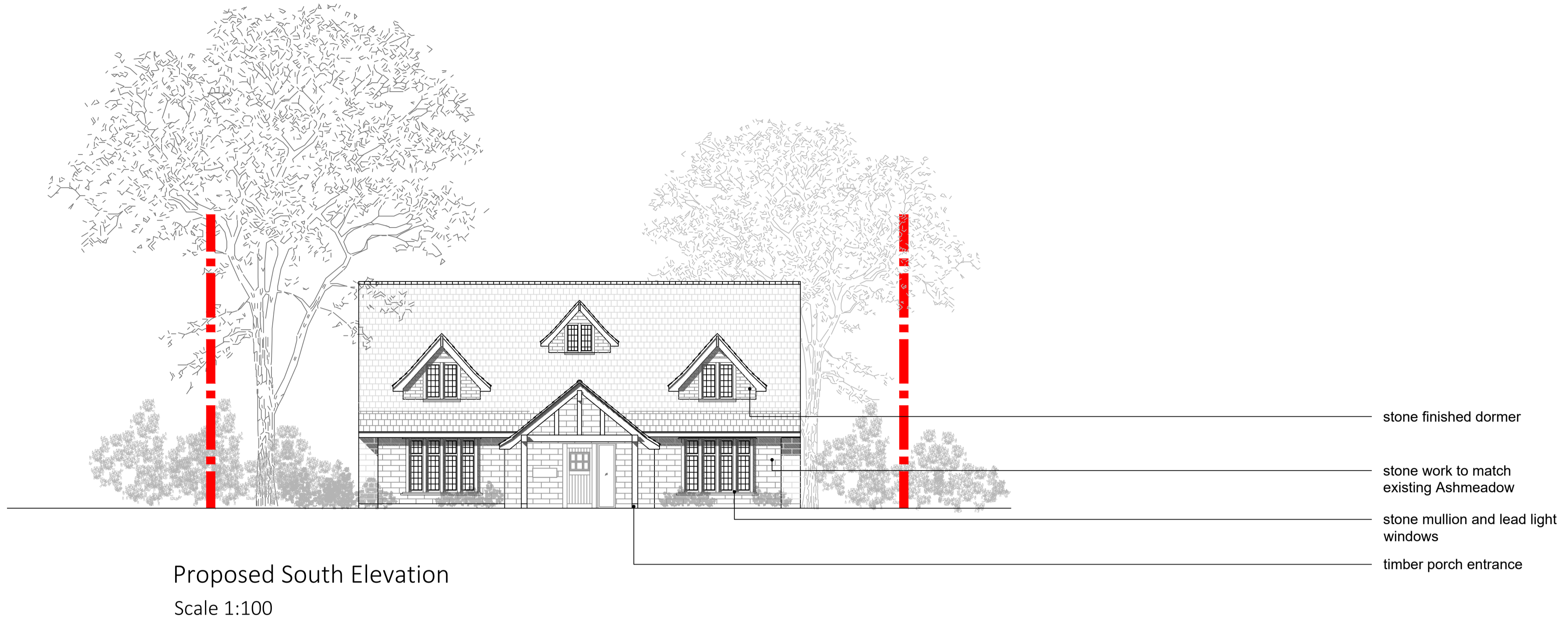
Proposed South Elevation Scale 1:100