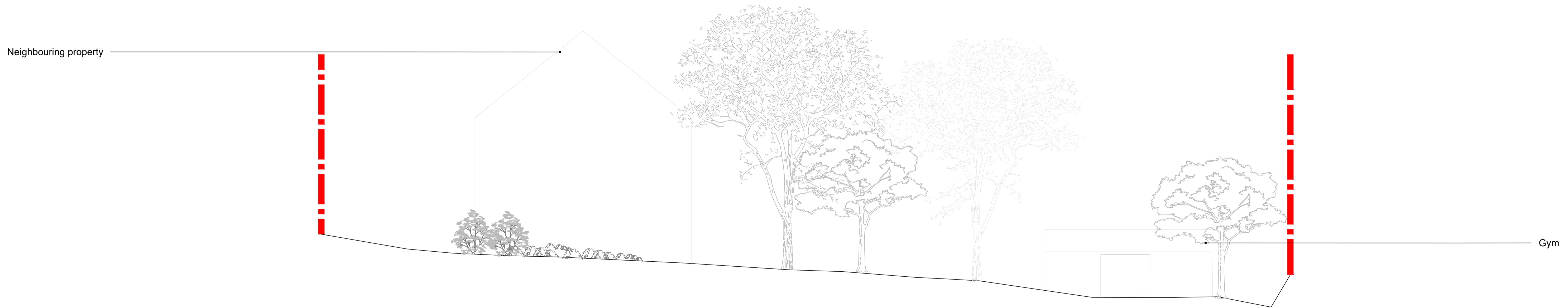
Existing East Elevation Scale 1:100