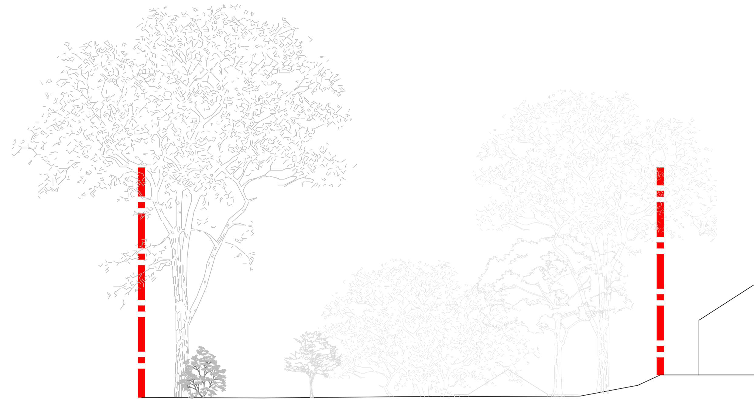
Existing South Elevation Scale 1:100