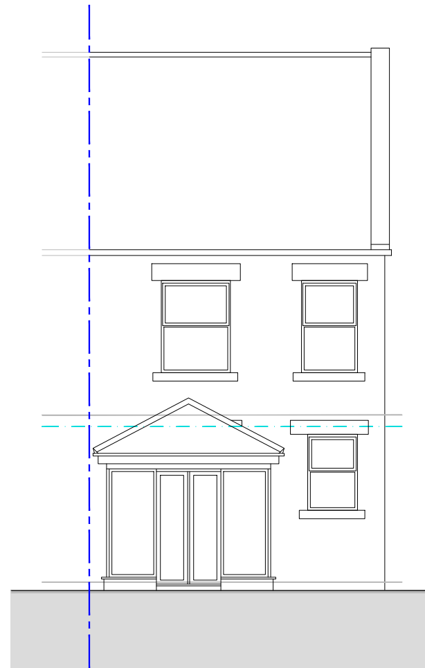
EXISTING REAR ELEVATION Scale 1:100 at A3