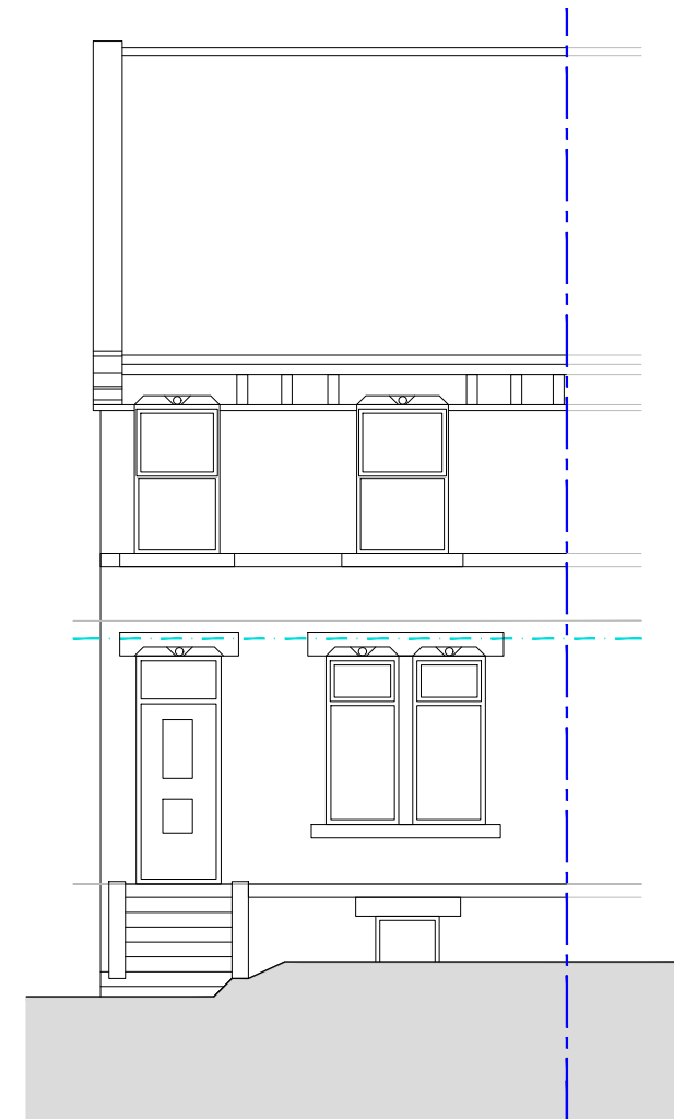
EXISTING FRONT ELEVATION Scale 1:100 at A3