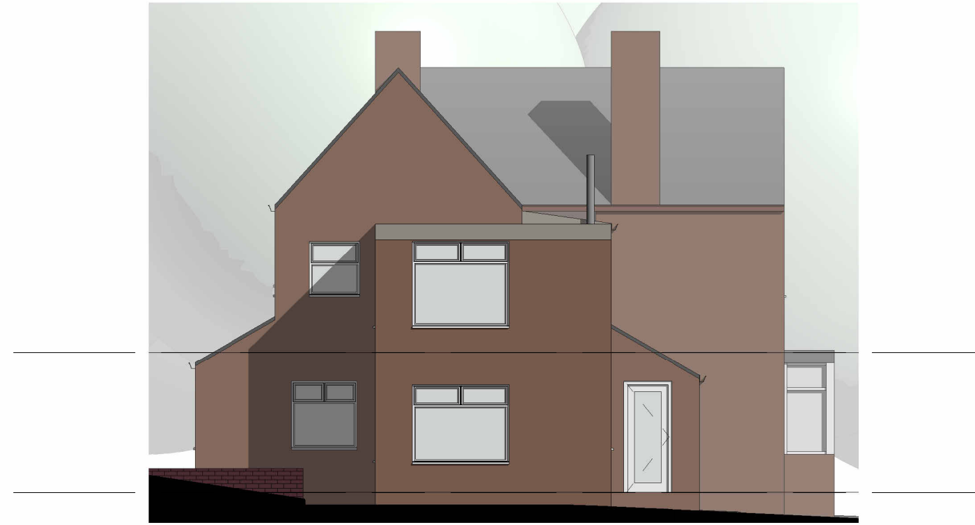
EXISTING EAST ELEVATION 1:100