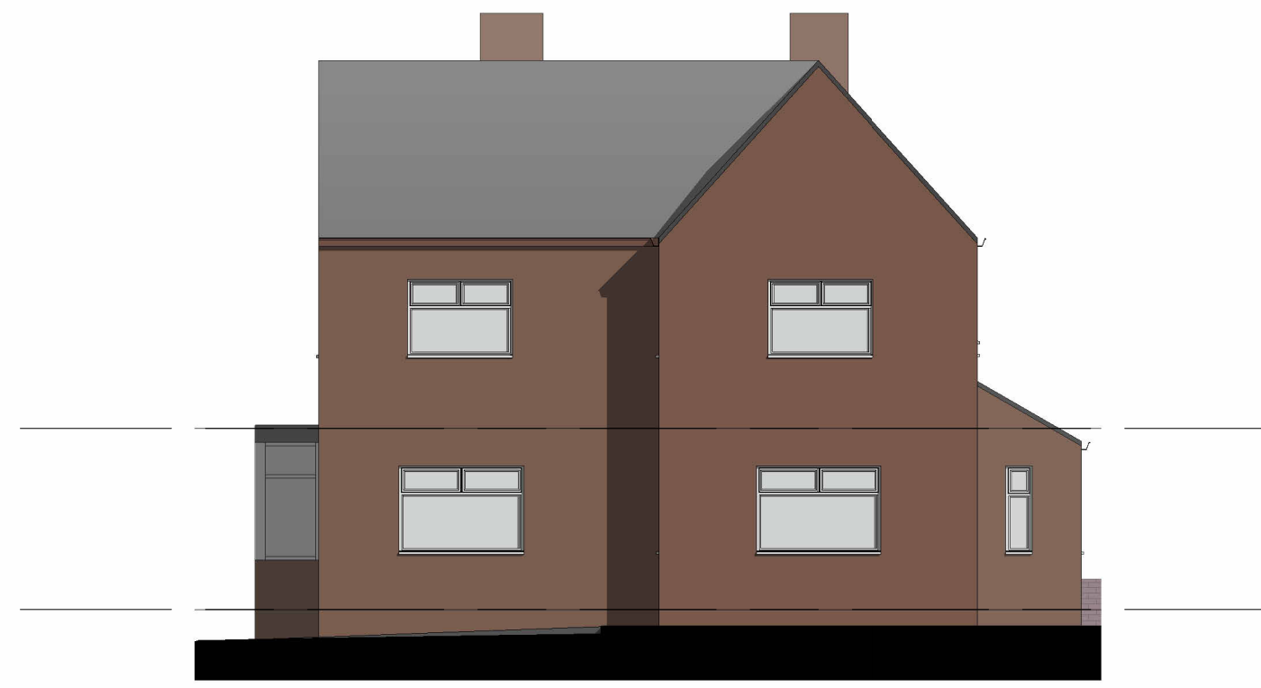
EXISTING WEST ELEVATION 1:100