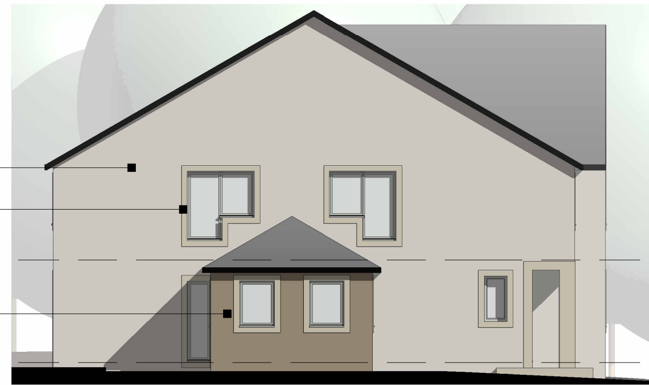
PROPOSED EAST ELEVATION 1:100