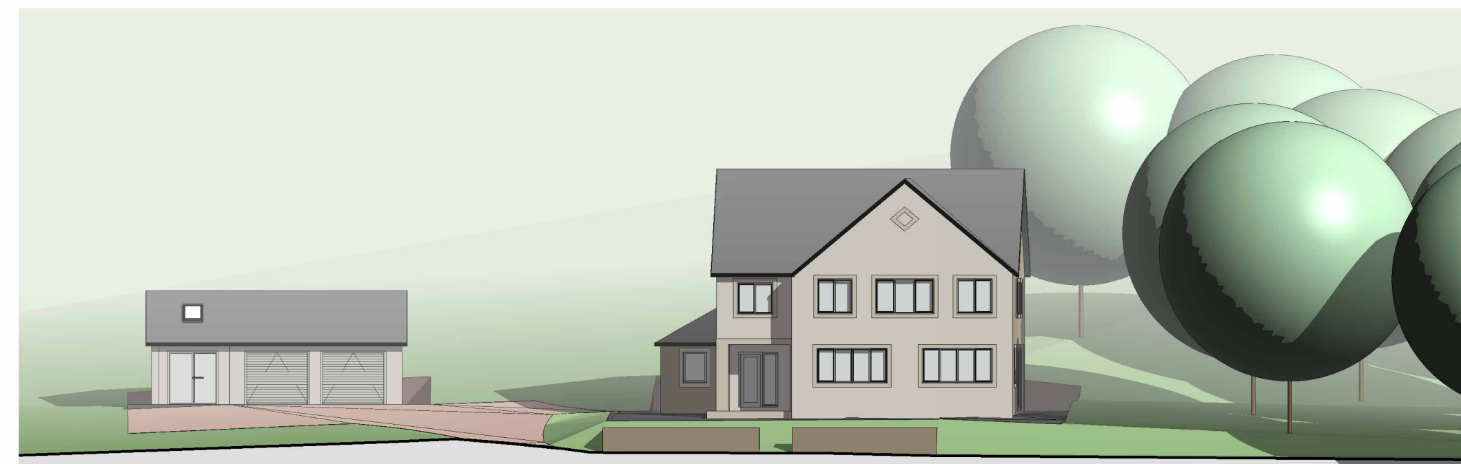
Proposed Site Section A-A 1:200