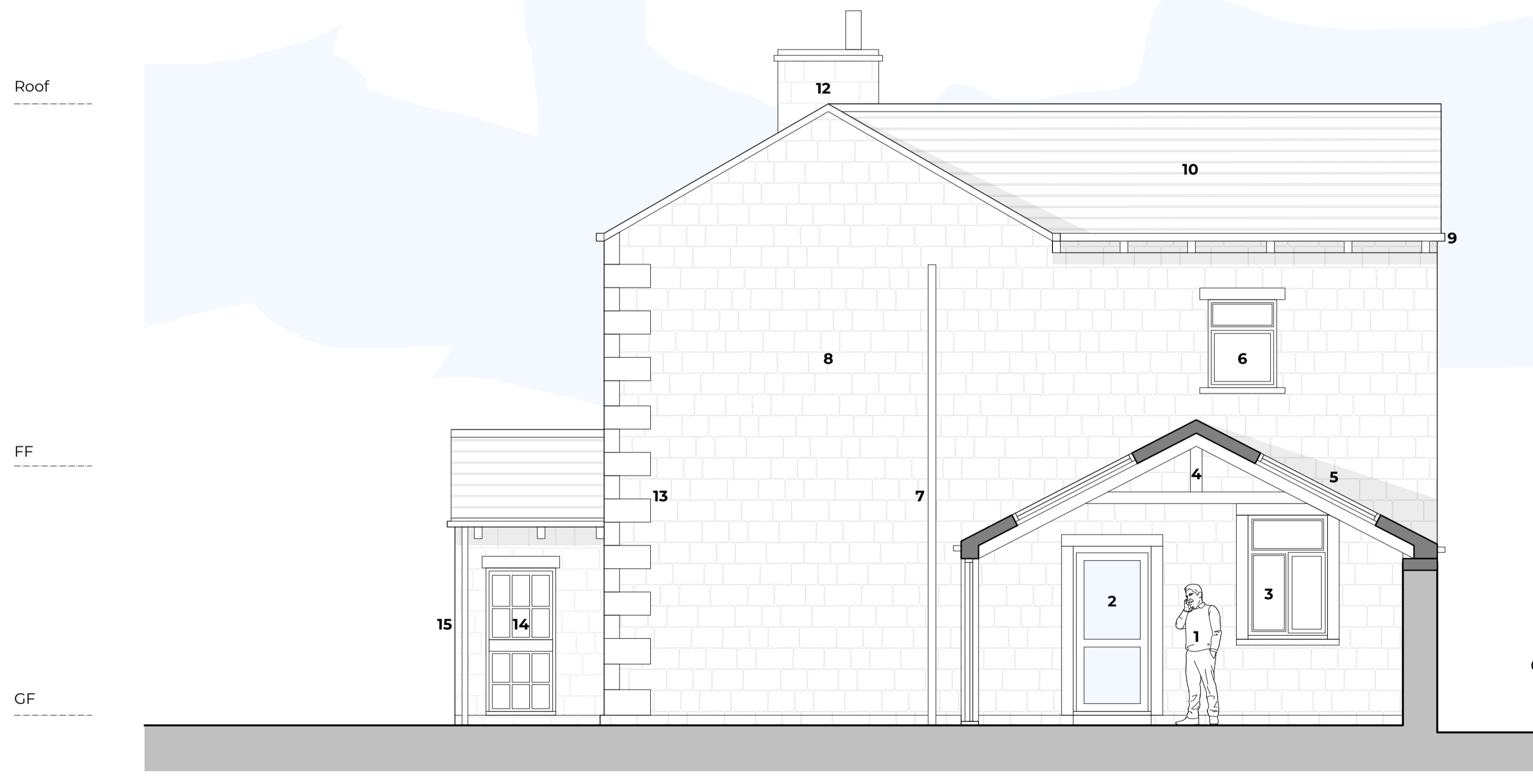
PR Proposed Section A