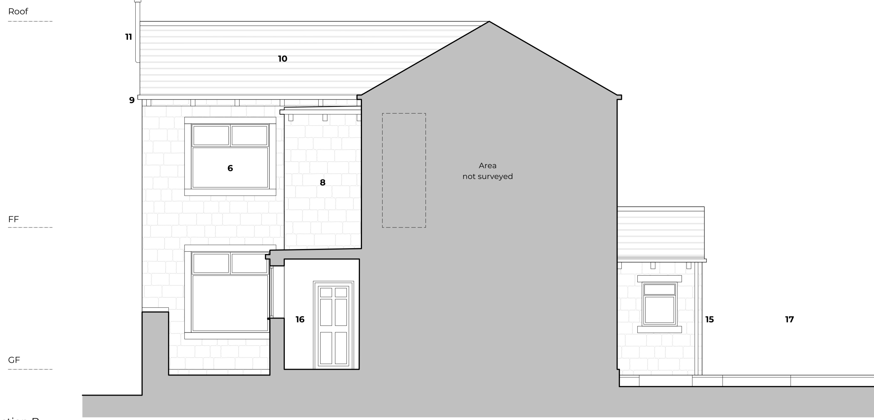
EX Existing Section B