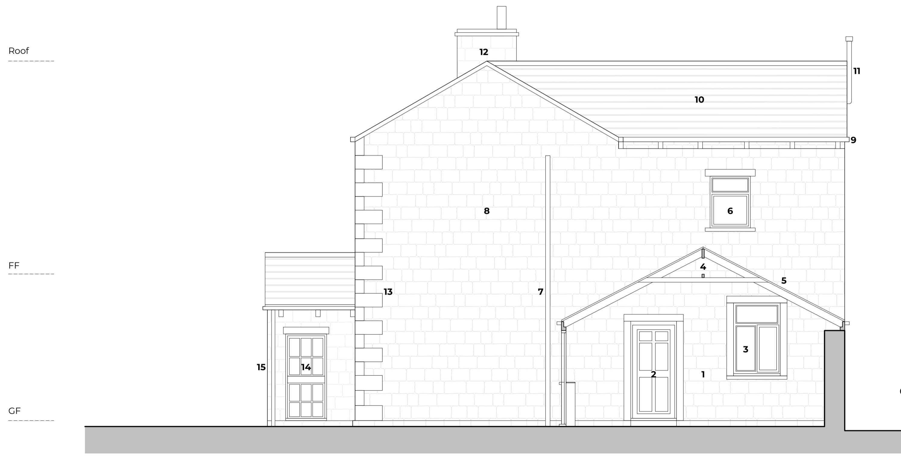
EX Existing Section A