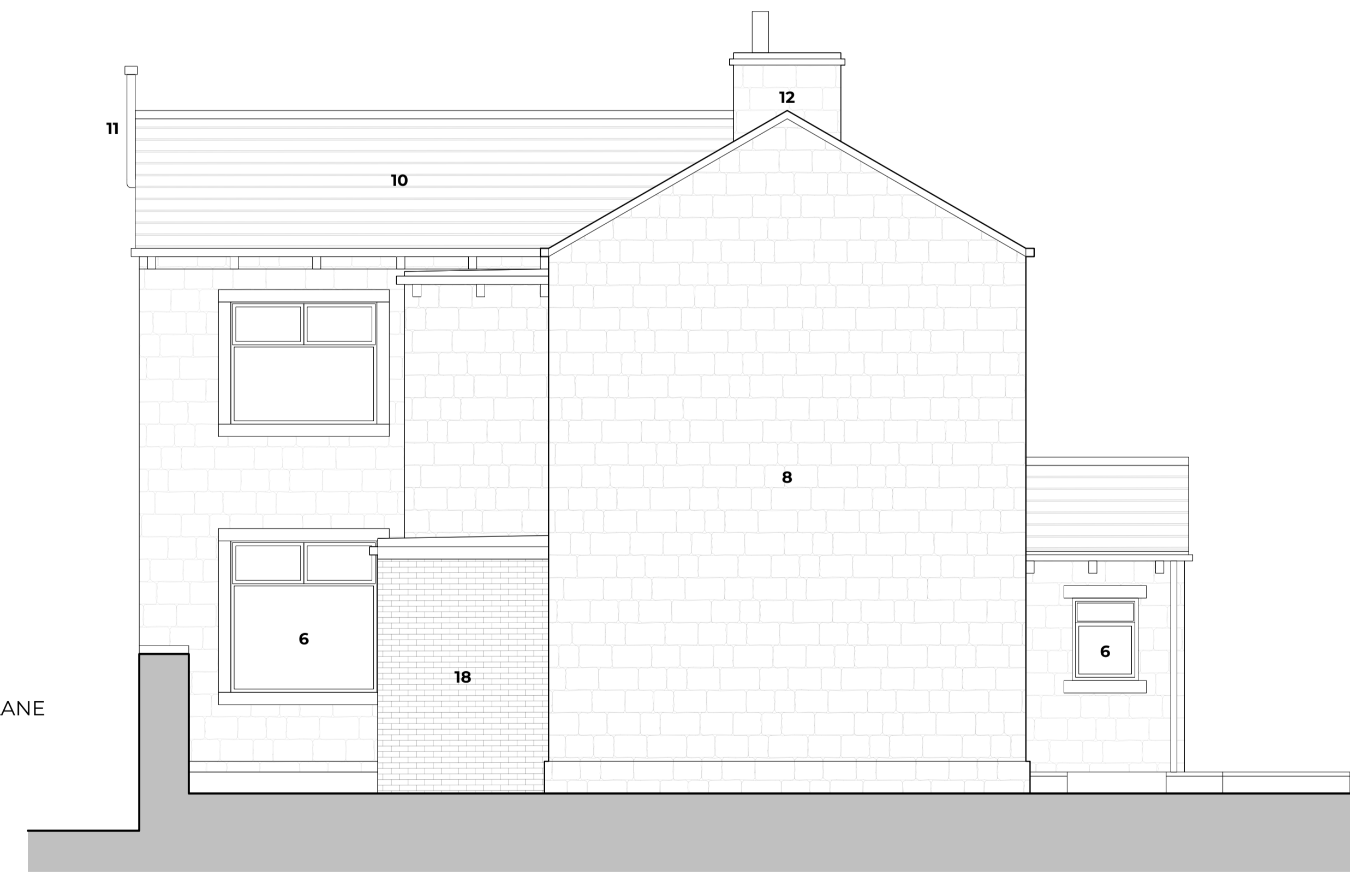
EX Existing West Elevation 03