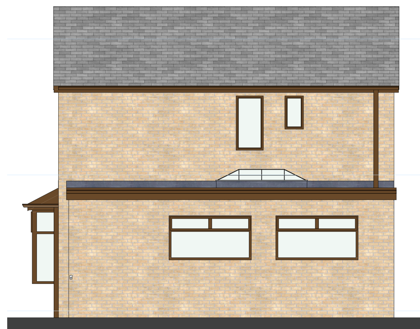
E-02 Elevation 1:50