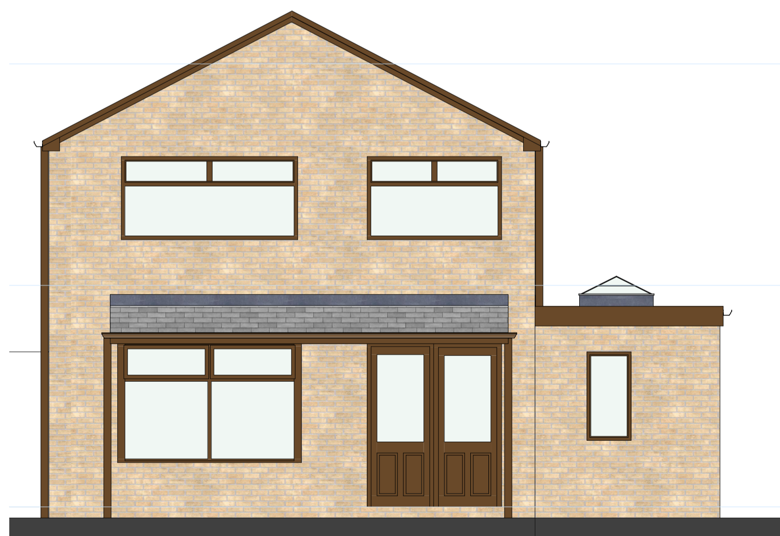
E-03 Elevation 1:50