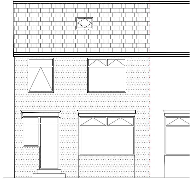
PROPOSED FRONT ELEVATION (East)