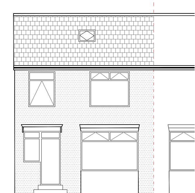
EXISTING FRONT ELEVATION (East)