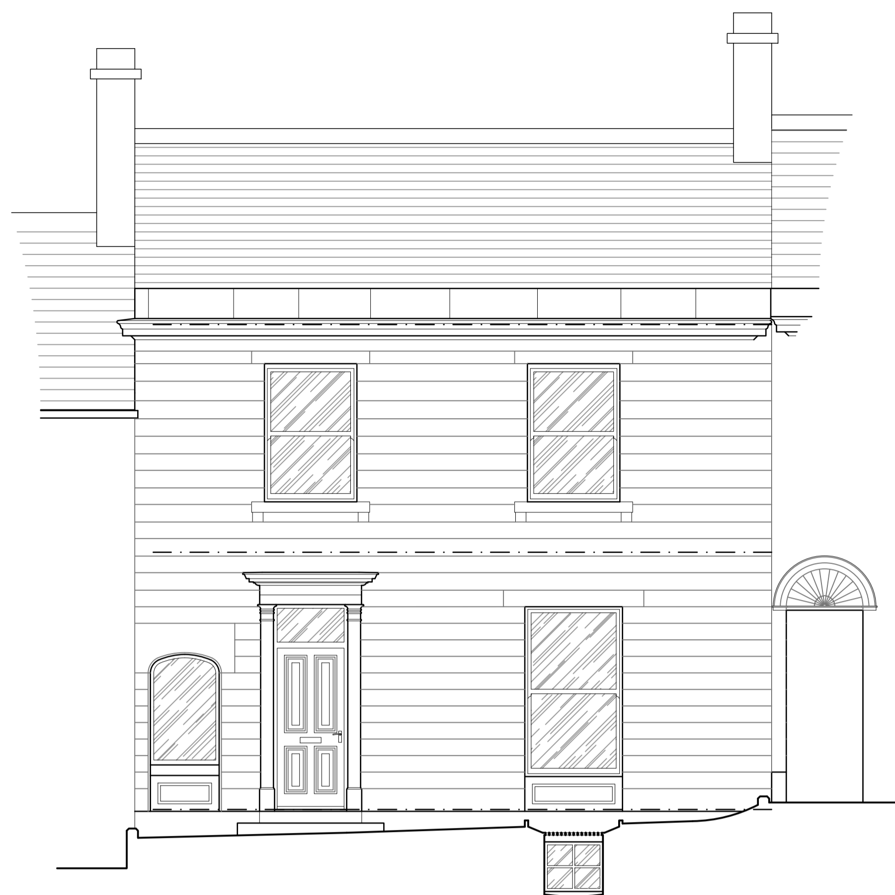
FRONT (TRINITY ST) ELEVATION NORTH EAST