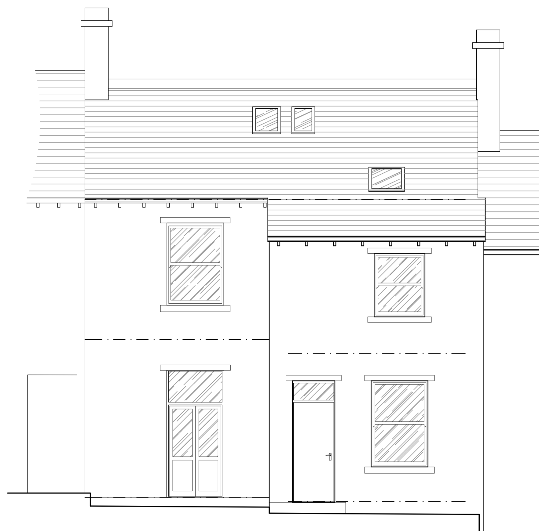
REAR ELEVATION SOUTH WEST