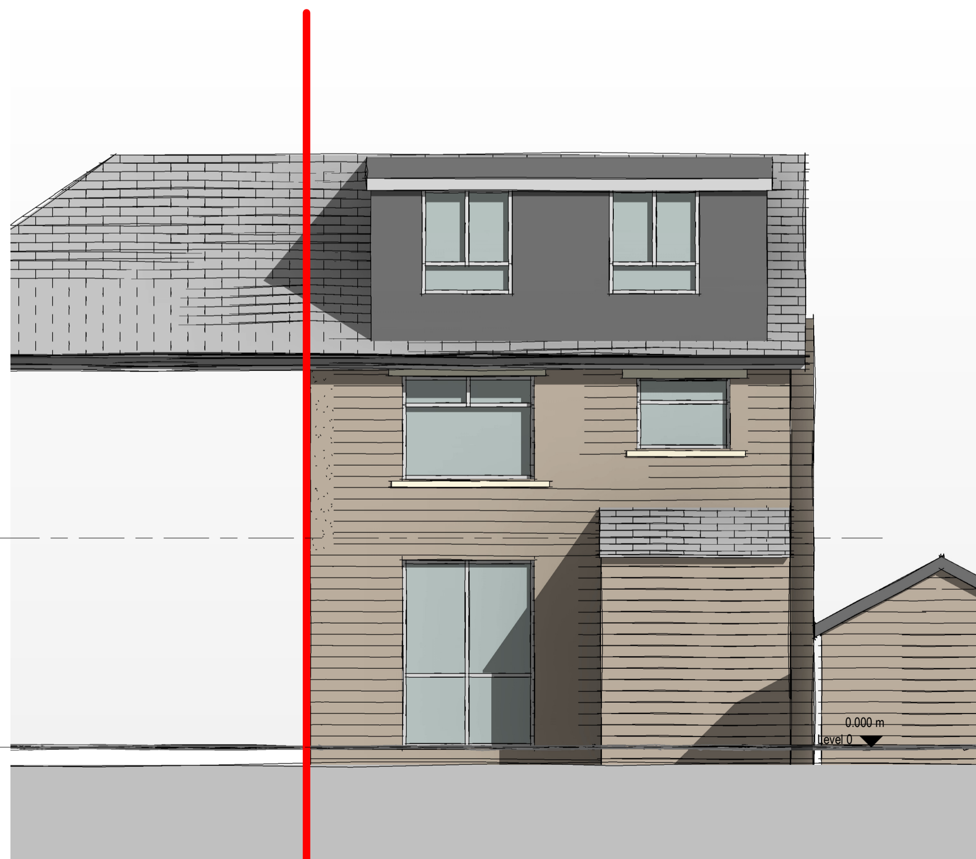
1 Existing Rear (South) Elevation 1 : 50