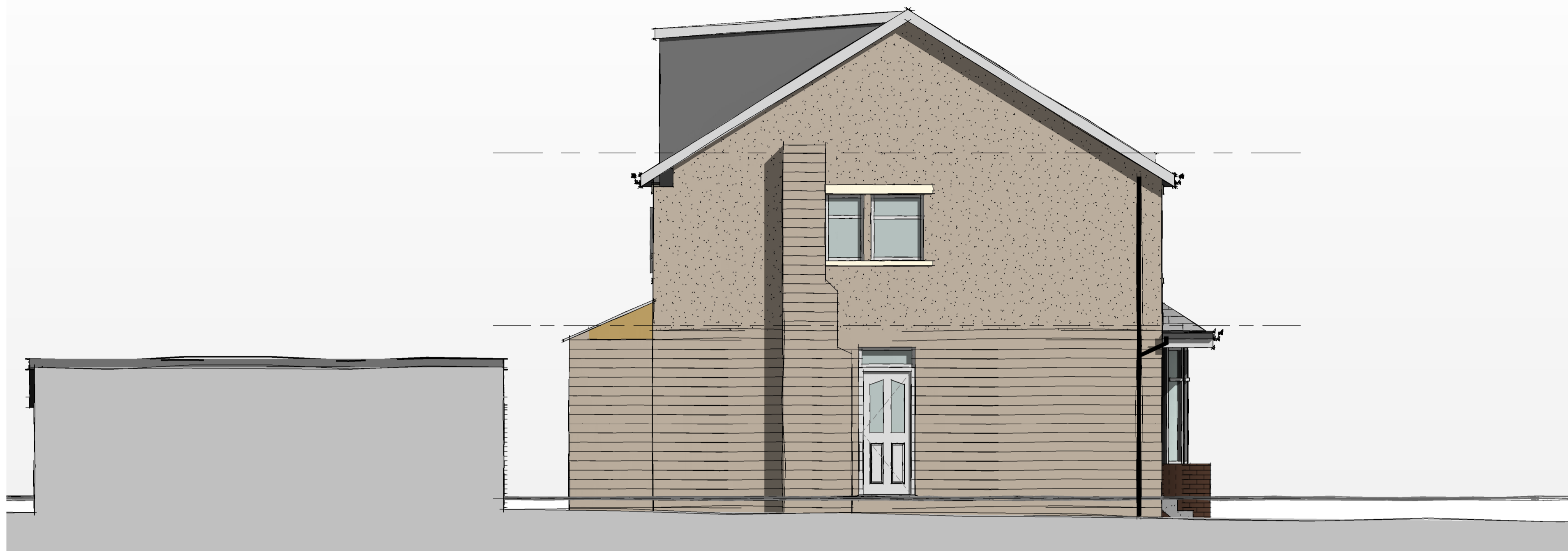
3 Existing Side (West) Elevations 1 : 50