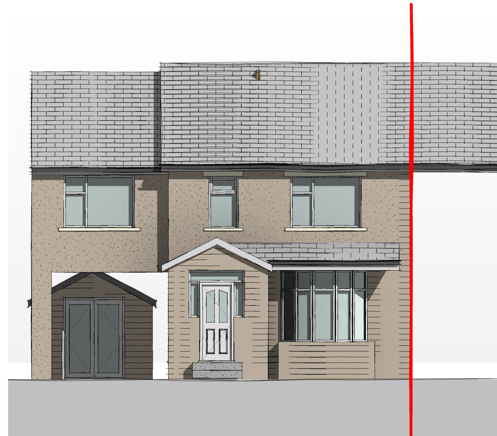
2 Proposed Front (North) Elevation 1 : 50