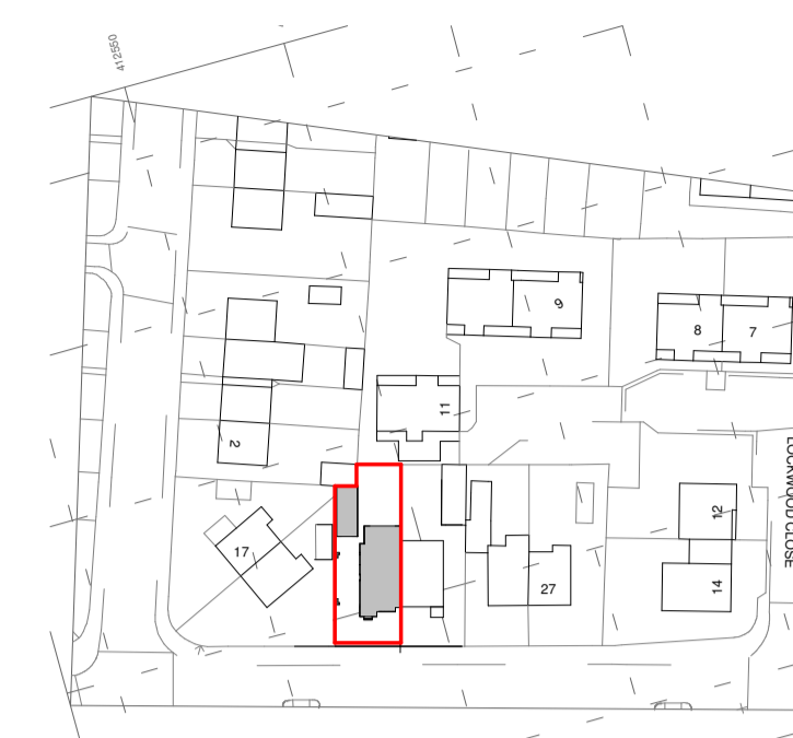
2 Location Plan 1 : 1250