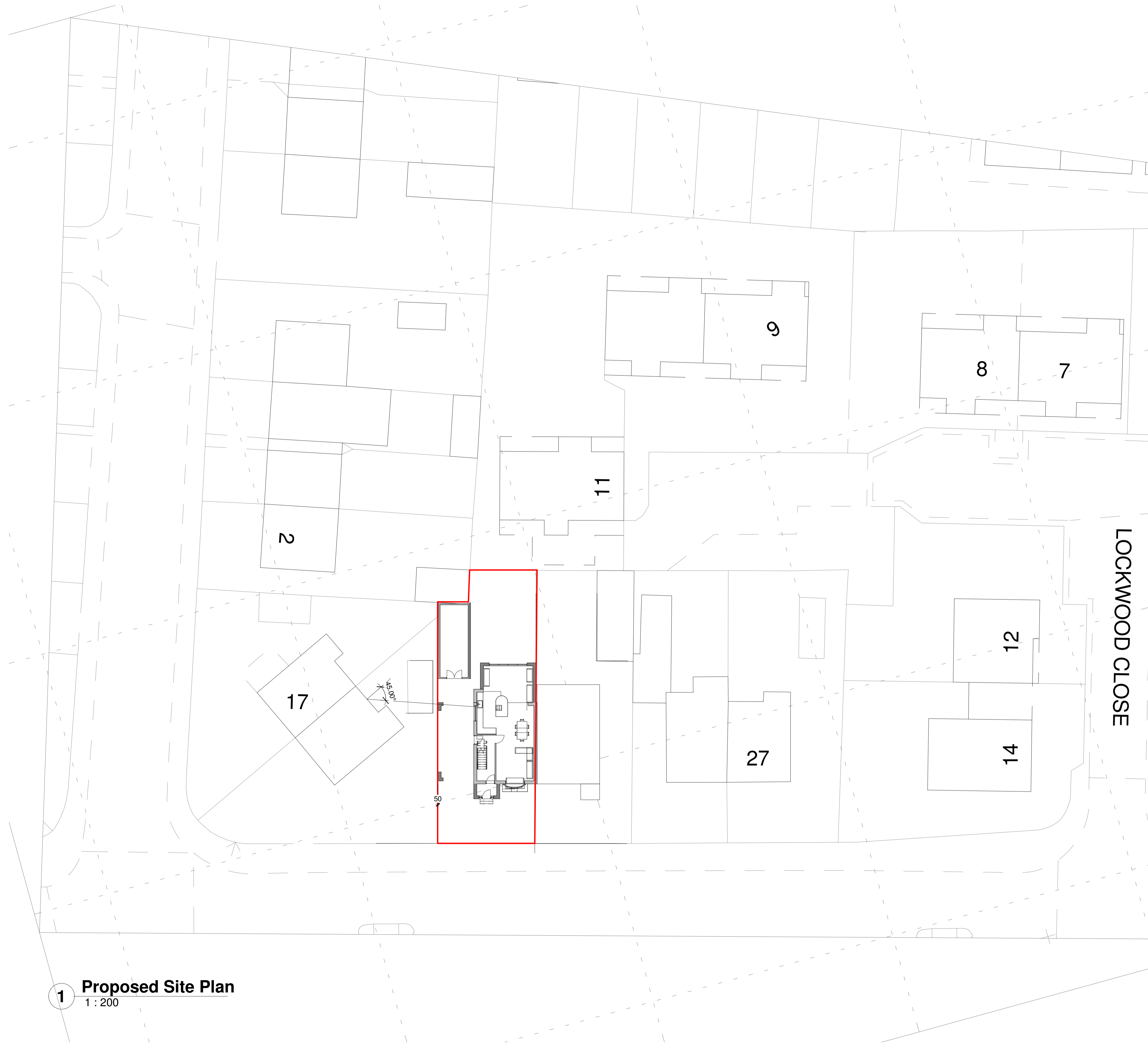
1 Proposed Site Plan 1 : 200