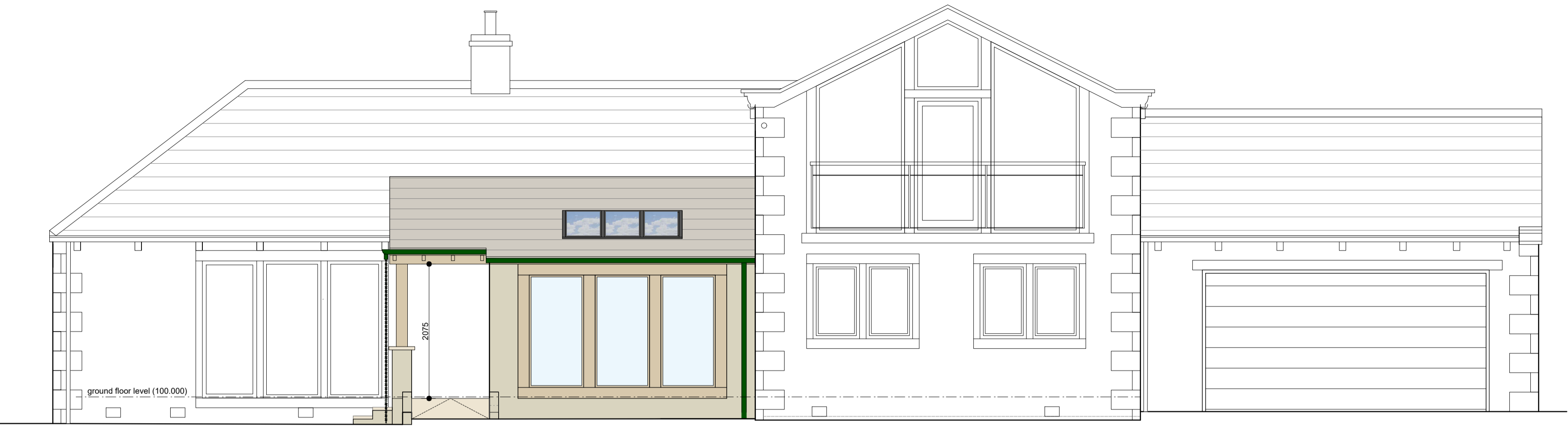
front (north) elevation