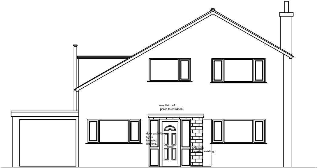
Proposed Front Elevations.