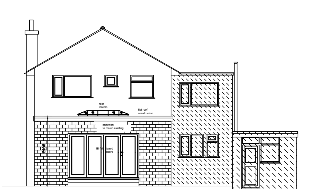
Proposed Rear Elevations.